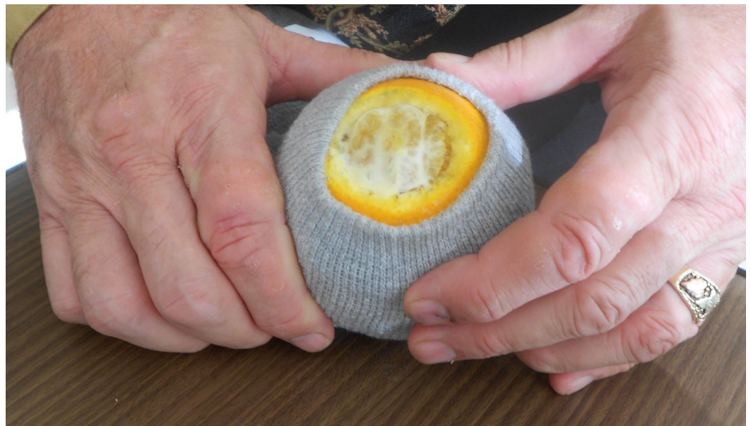
FIGURE 4: Positioning the cervical model such that it can be accessed through the neck of the sock.

Once positioned, slide the sock up over the fruit, maintaining equal movement on all sides so that the "cervix" remains at the end of the neck.