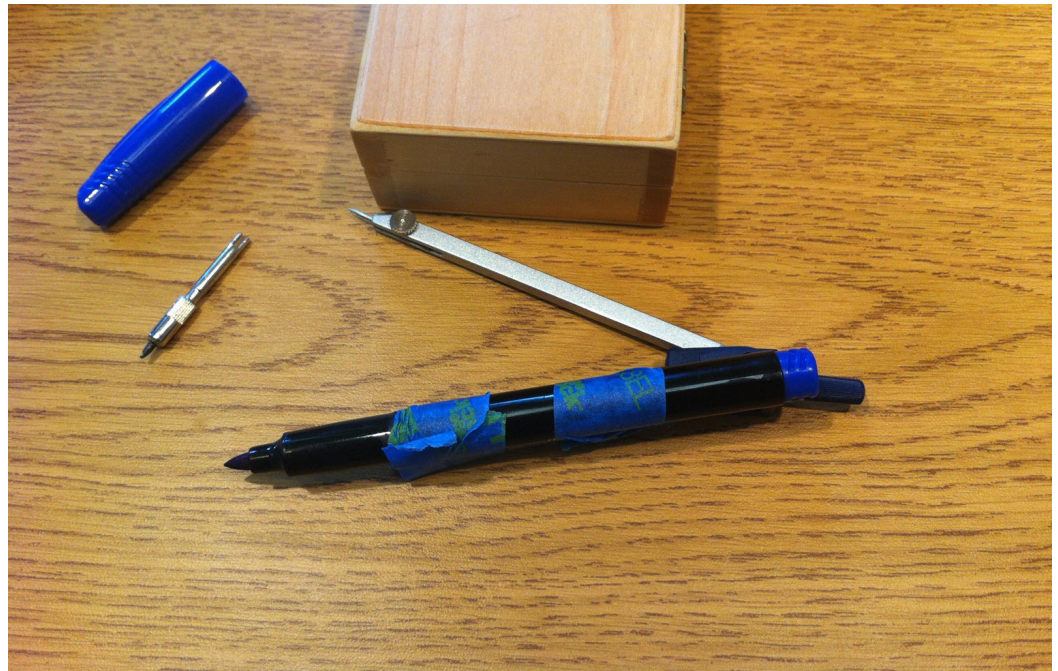
FIGURE 2: Felt-tipped pen secured to draftsman's compass