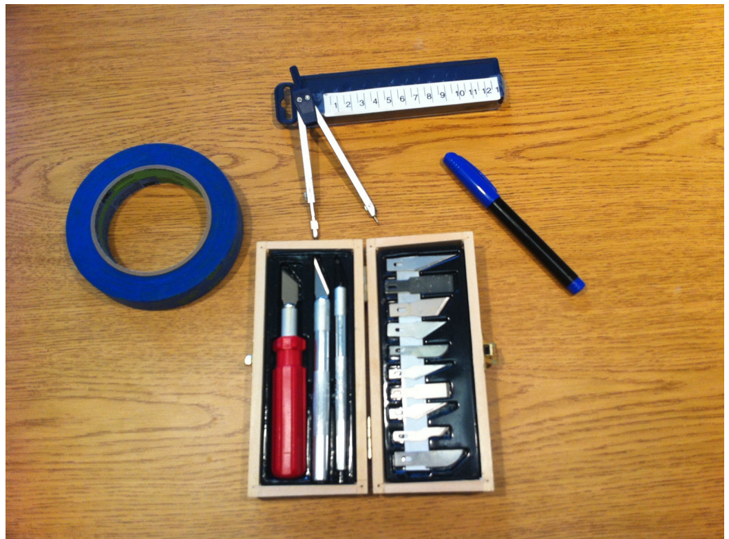
FIGURE 1: Tools needed to create models

-Mark the fruit with desired diameters and effacements for each model.