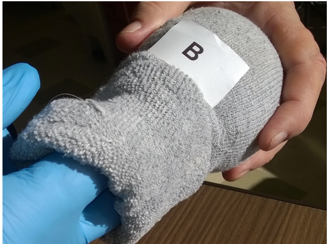
FIGURE 6: Simulated vaginal examination being performed by a student