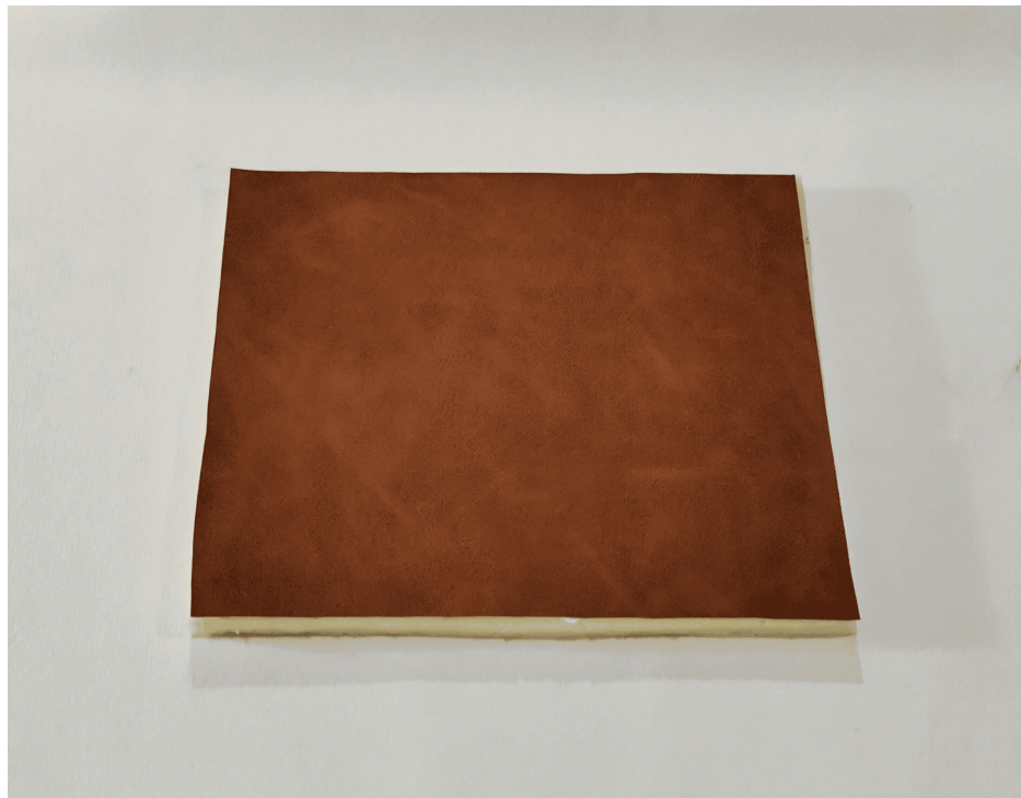
FIGURE 2: The PUL suture training pad