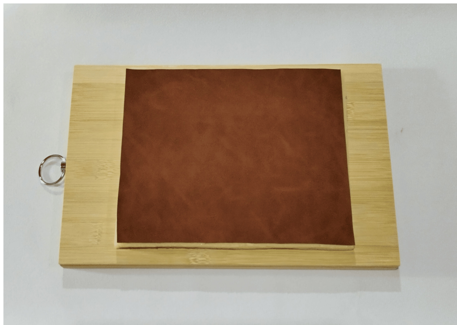
FIGURE 3: The PUL suture training model