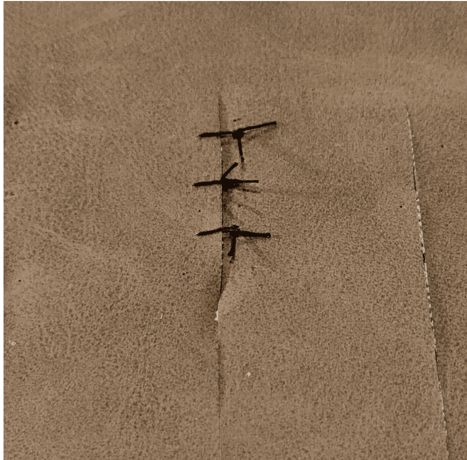
FIGURE 4: Simple interrupted suture on the PUL suture training model

Suturing Training: Students begin by familiarizing themselves with suturing instruments, including the needle holder, forceps, scissors, and various types and sizes of sutures. They will practice instrument handling methods, using the model for various types of suturing (simple interrupted, vertical/horizontal mattress, continuous suture, and figure-of-eight) with both monofilament and multifilament sutures, and knotting with instruments (Figures 4, 5).