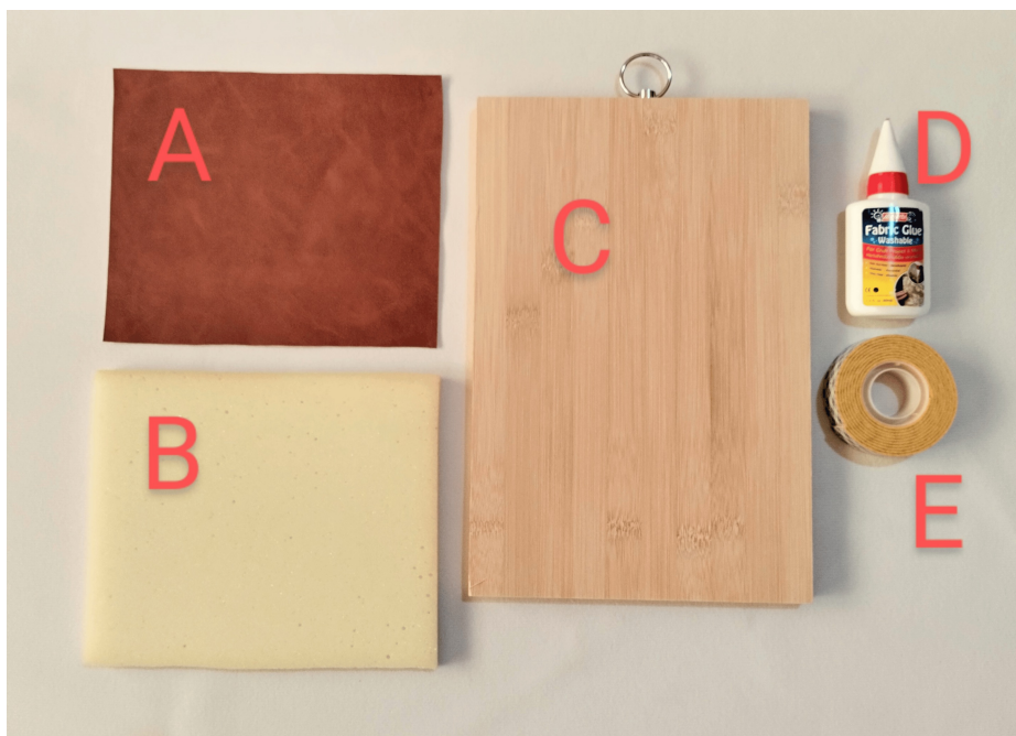
FIGURE 1: The materials for making the PUL suture training model

A = PUL (Polyurethane Leather) plate; B = sponge pad; C = wooden cutting board; D = fabric glue; E = double-sided adhesive foam tape