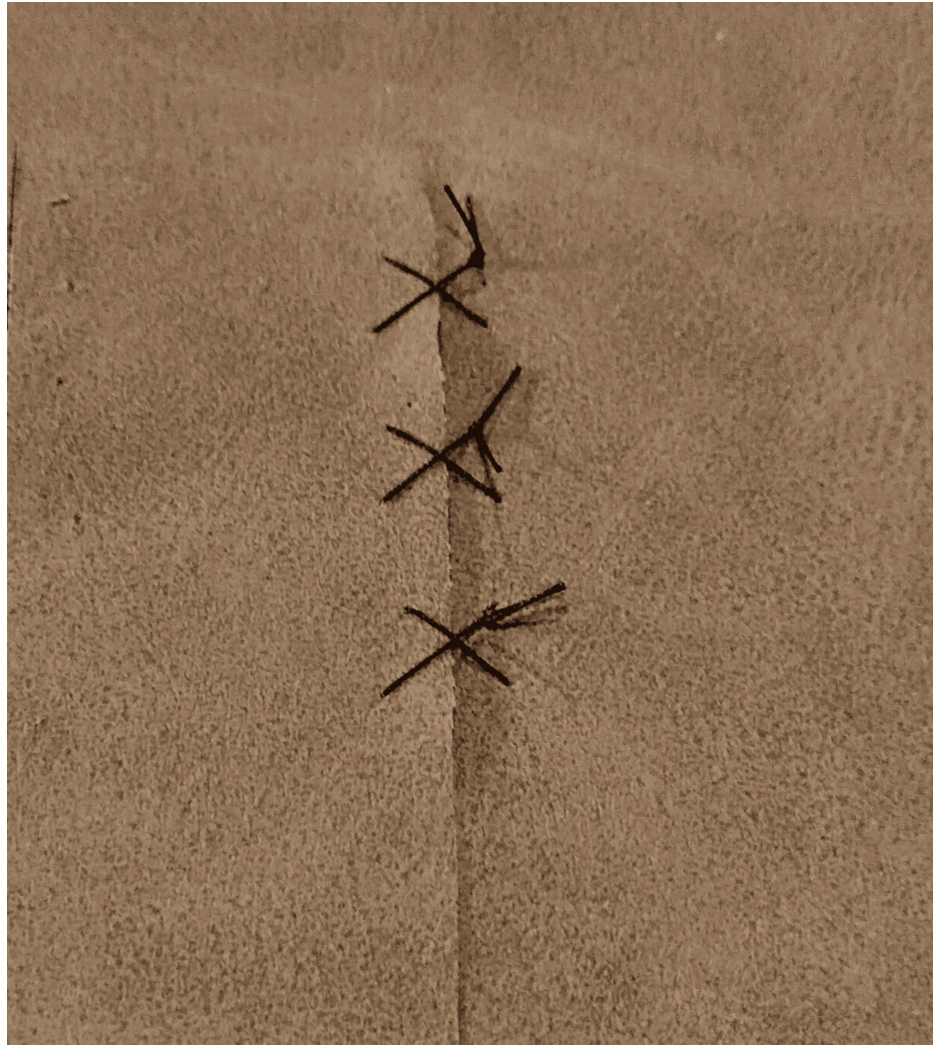
FIGURE 5: Figure of eight stitches on the PUL suture training model