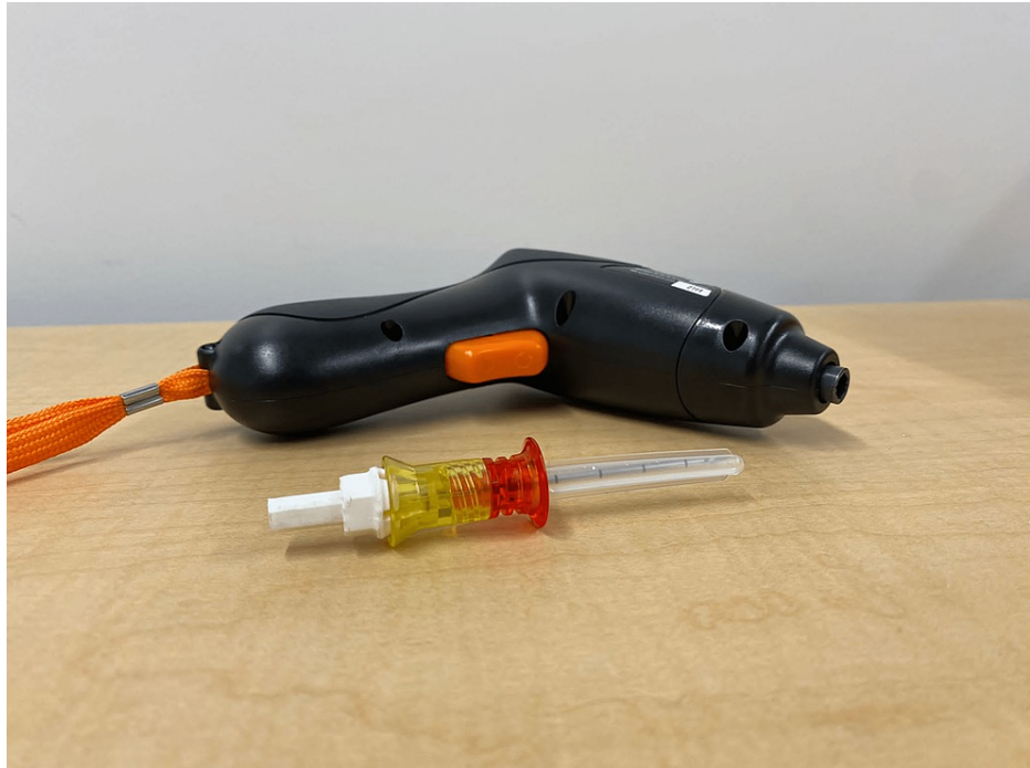
FIGURE 1: IKEA screwdriver and 15 mm Arrow® EZ-IO® Power Driver (Teleflex, Morrisville, North Carolina, United States) training needle with Version A needle adapter attached.