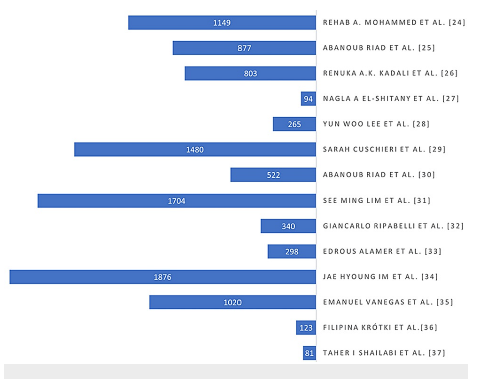
FIGURE 2: The number of participants in each study who received the Pfizer-BioNTech vaccine and reported at least one or more side effects.

All studies were published between 2021 and 2022. Of 14 studies, 13 were published in 2021 and only one in 2022. Characteristics of the selected articles are summarized in Table 1. All included studies were written in English. Side effects on the local level were more prevalent than adverse effects on the systemic level. Females suffer more side effects than males. Following the second dosage, there were greater adverse effects than the first. After the first dose, the average side effects were 79% and 84% after the second dose. However, in most subjects, adverse effects were mild and short-term. Anaphylactic shock or severe reactions are rare.