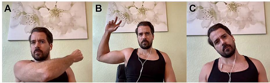
FIGURE 3: A: Modified Crossover (Scarf) Test. B: Modified Apprehension Test. C: Assessment of Cervical Spine Range of Motion.

By considering patients' detailed history and information gained through questions and self-physical examination, it is possible to exclude emergencies and formulate a feasible differential diagnosis for shoulder conditions via telephone. Table 3 provides sample notes for findings during a normal shoulder during a telephone visit.