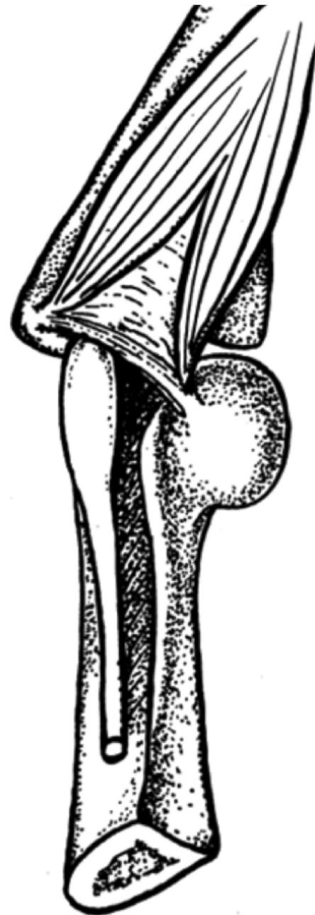
FIGURE 2: Drawing of Osborne's ligament

Note the entrapment site at the postcondylar groove with a pseudoneuroma of the ulnar nerve proximal to the ligament (Published with permission from [5]).