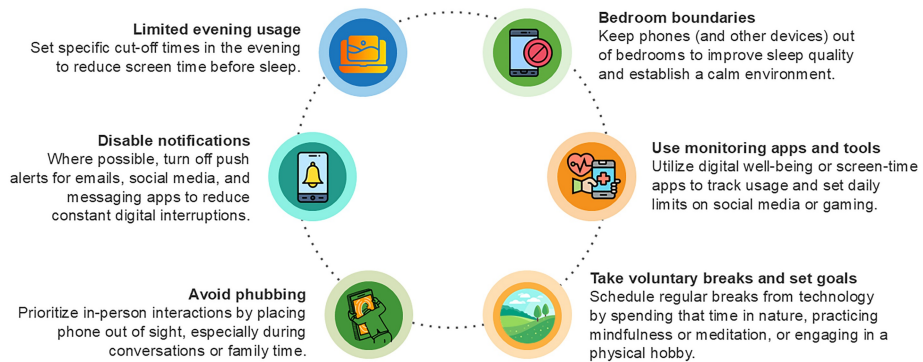
FIGURE 2: Digital detox strategies for everyday life

treatment or used by individuals for everyday life.