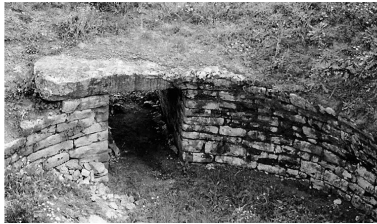
FIGURE 8: The tomb of Machaon

Many centuries later, in 1891, the excavations brought to light the tomb of Machaon, in the Necropolis of the ancient city of Gerenia, by the archaeologist Christos Tsoundas (1854-1934) [Figure 8]. The large dome of the Mycenaean tomb was well preserved but unfortunately, it had been robbed and only a few burial offerings were found inside the main tomb chamber [30]. The inscription on his gravestone was: "This is the burial place and Shrine of Machaon of Asclepius, a holy place" (Greek: Μαχάουος του Ασκληπιού μνήμα και ιερόν εστίν άγιον). Gerenia is probably the place, where the deification of the mortal heroic warrior and therapist Machaon was initiated soon after his apheroismos (Greek: αφηρωισμός, heroized, distinguished among dead and worshiped as god) [14].