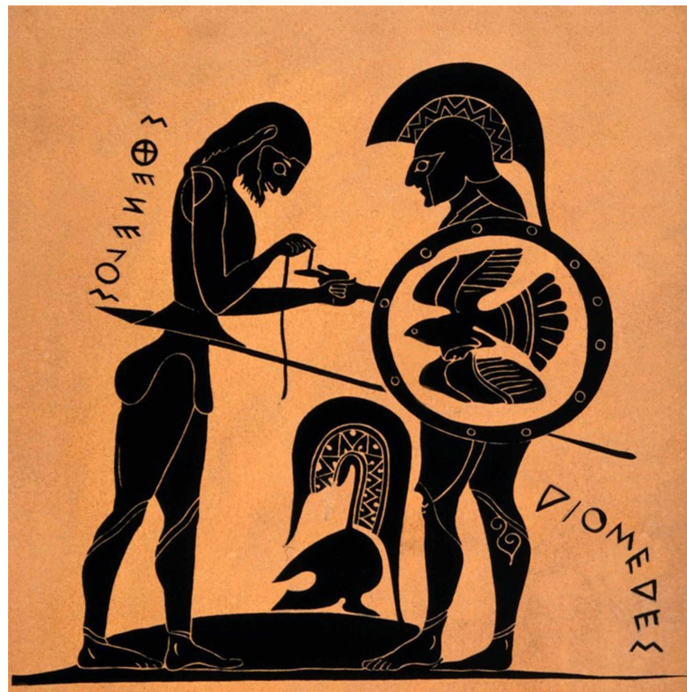
FIGURE 2: Sthenelos bandaging the wounded finger of Diomedes

Sthenelos bandaging the wounded finger of Diomedes, ink drawing after a Chalcidian neck-amphora (now lost) ca 550 BC