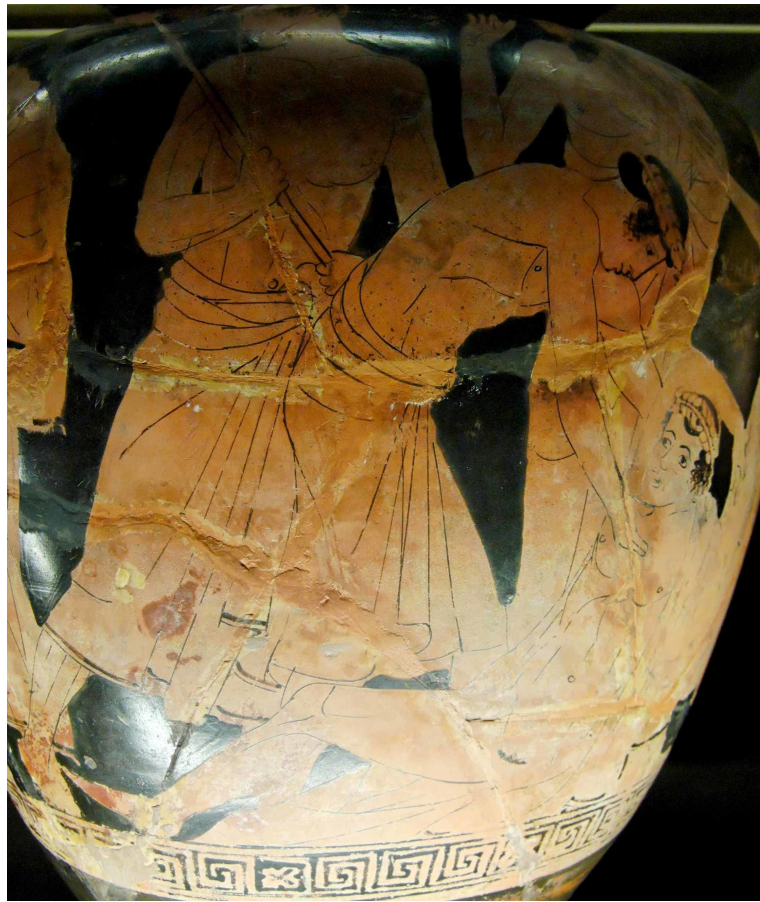
FIGURE 6: Philoctetes, wounded, is abandoned by the Greek expedition en route to Troy

Philoctetes, wounded, is abandoned by the Greek expedition en route to Troy, detail of an Attic red-figure stamnos, ca 460 BC, Musée du Louvre, Paris. [ https://en.wikipedia.org/wiki/Philoctetes#/media/File:Philoctetes_Hermonax_Louvre_G413.jpg ]