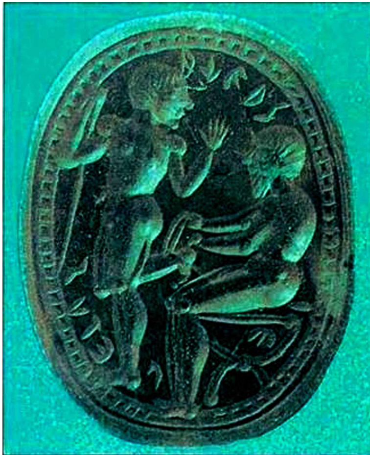
FIGURE 7: Machaon binds Philoktetes who turns to speak to him

Machaon binds Philoktetes who turns to speak to him, Etruscan sealing stone, 2nd half of the 5th century BC, British Museum, London [ https://www.quora.com/Can-people-who-understand-Attic-Greek-understand-Koine-Greek-and-vice-versa ].