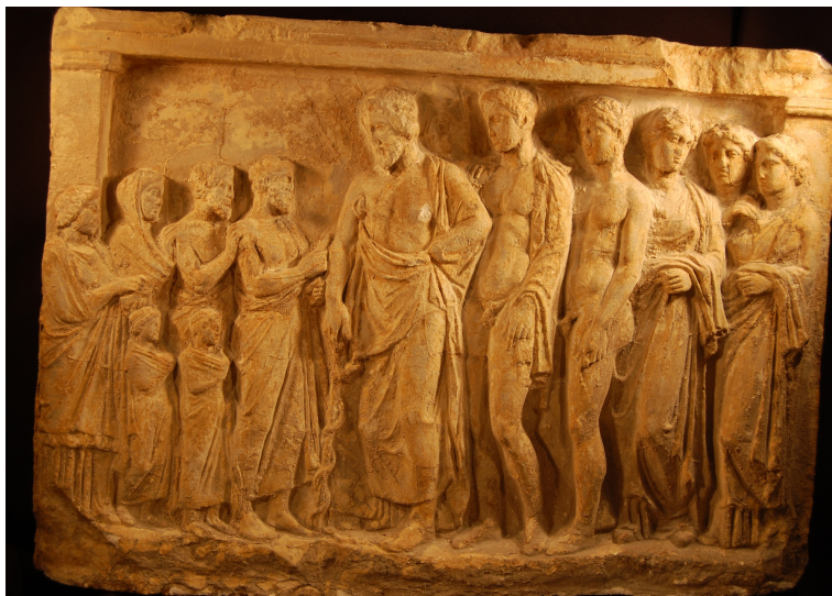
FIGURE 3: Asclepius with his sons

Asclepius with his sons Podalirius and Machaon and his three daughters, with supplicants, Greek relief ca 470-450 BC, found at Thyrea, Greece, National Archaeological Museum of Athens. [ https://wellcomecollection.org/works/ekkh79b ]