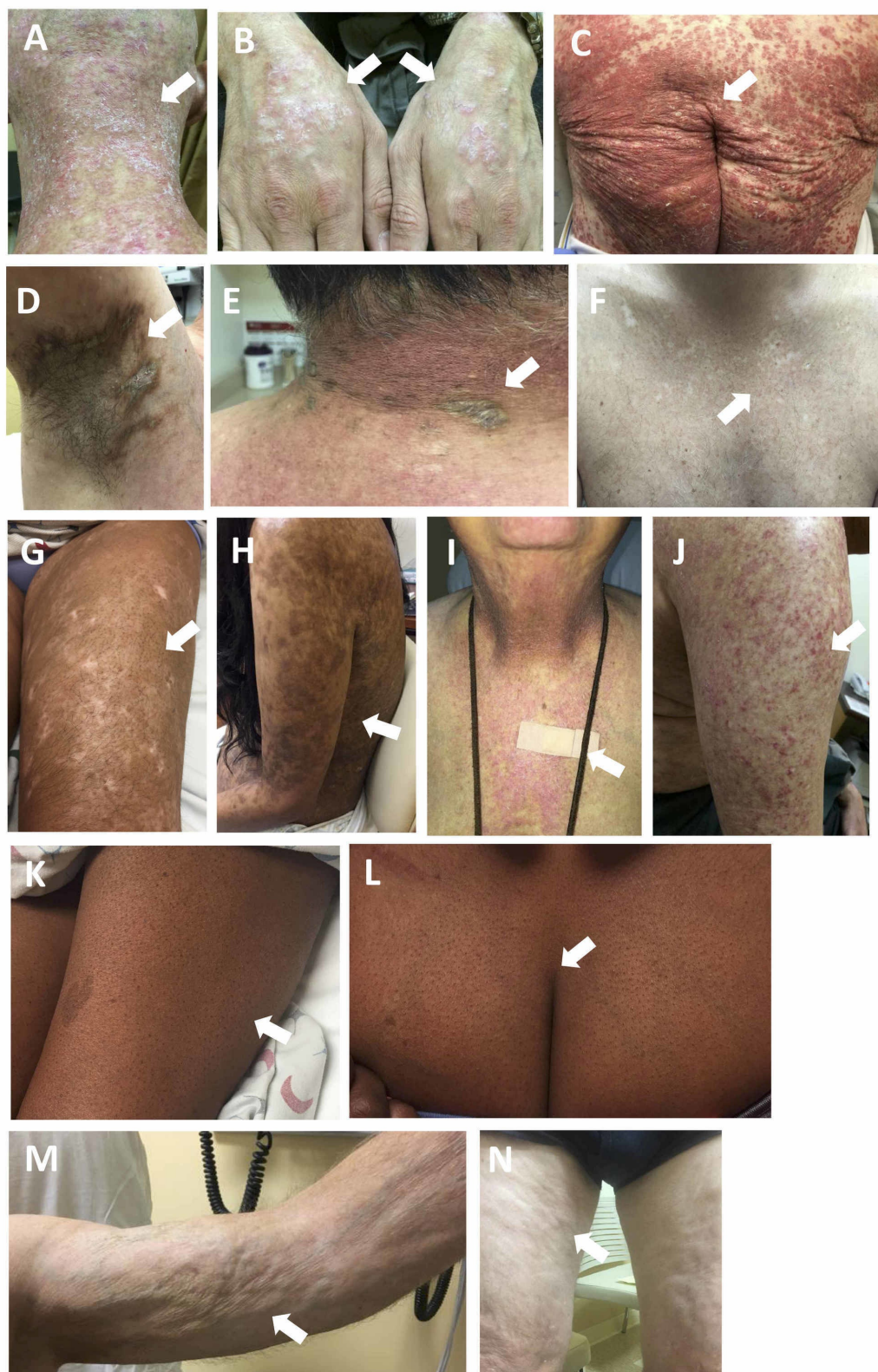
FIGURE 1: Examples of cutaneous chronic graft-versus-host disease morphologies

A, B: lichen planus-like; C: papulosquamous-like; D: lichen sclerosus-like; E: morphea-like; F, G, H: dyspigmentation; I, J: poikilodermatous; K, L: keratosis pilaris-like; M, N: dermal and subcutaneous skin changes