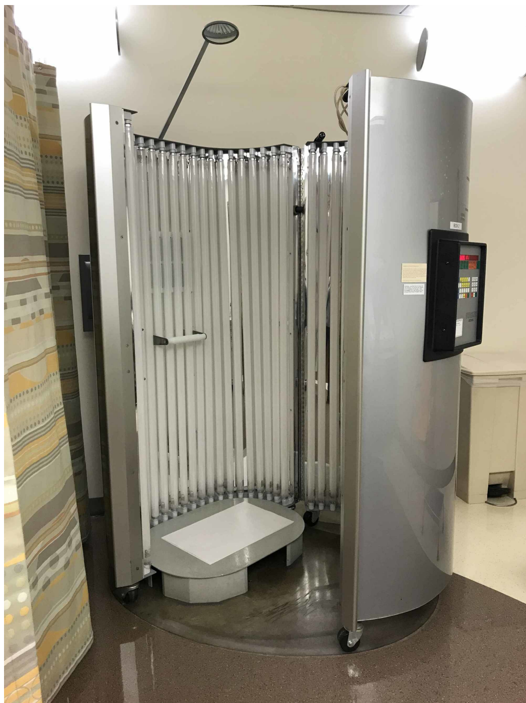
FIGURE 3: Ultralite full-body phototherapy system

(Ultralite Enterprises, Inc., Dacula, GA)