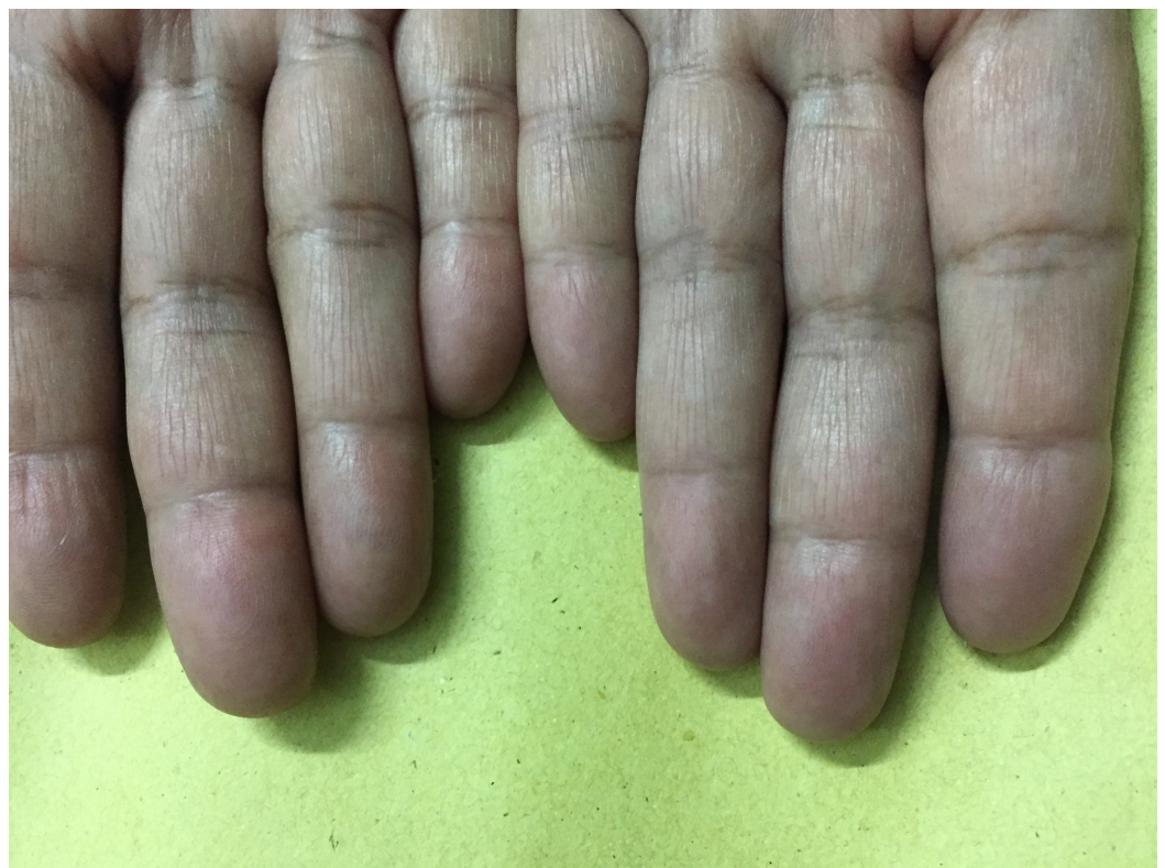
FIGURE 1: Acquired idiopathic adermatoglyphia in a 59-year-old female patient showing fingers of both hands

ridge pattern [6]. It can be limited to a few digits or all fingers and can also refer to the absence of the ridge patterns formed on the plantar aspects of the feet. Furthermore, adermatoglyphia can refer to a partial loss of the ridges (i.e., ridges are unnoticeable on general evaluation but detectable on deep inspection or under a magnifying lamp) or a complete absence (depicting total effacement) of epidermal ridges. Such scenarios present time-consuming challenges not only for the authorities but also for the concerned individual, in completing verification procedures (Figures 1, 2). Face recognition and fingerprinting are the primary modes of biometric I&A worldwide. Any technical problem or error hampering this series of verification steps can cause the entire verification process to come to a halt [7]. This article discusses the obstacles faced by patients suffering from adermatoglyphia undergoing a mandatory biometric fingerprinting procedure. Additionally, this review highlights the necessity of a standardized, globally acceptable criterion that can act as a biometric substitute protocol. Such a biometric substitute system can function as a backup option under circumstances when the conventional fingerprinting verification fails or is not applicable (e.g., patients suffering from adermatoglyphia or amputated limbs).