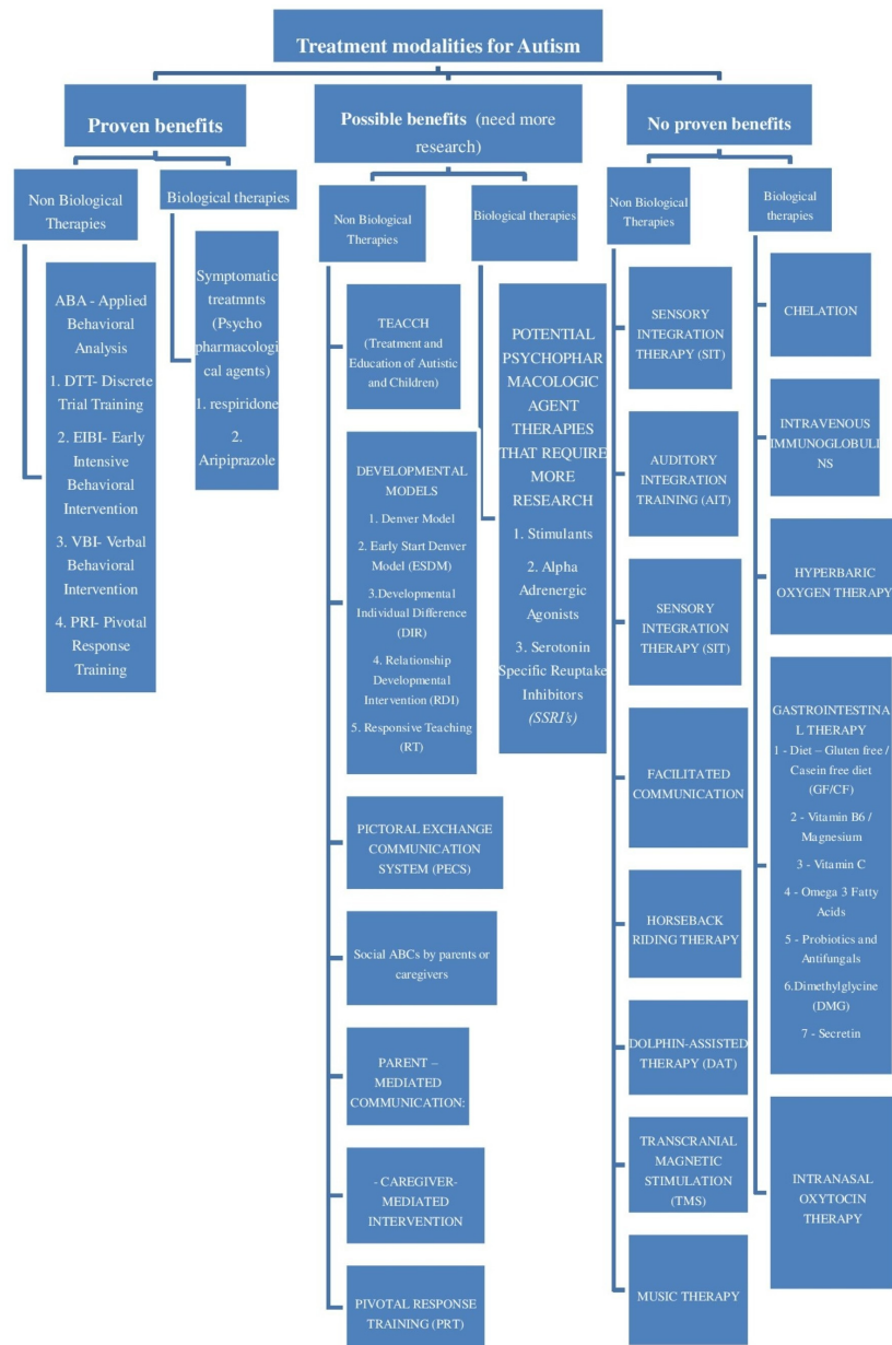
FIGURE 2: Various biological and non-biological therapies for autism.

Categories of various treatment modalities with proven and unproven benefits.