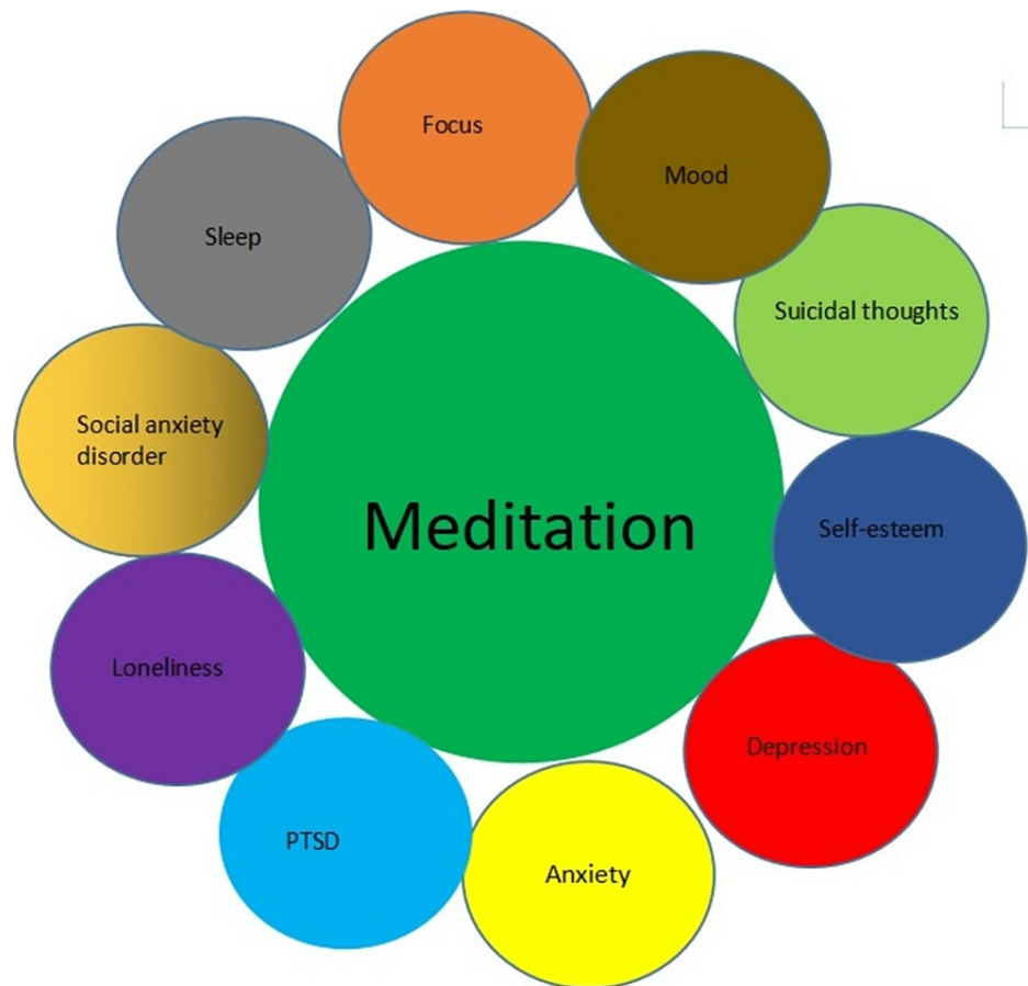
FIGURE 2: Meditation and its effect on mental health