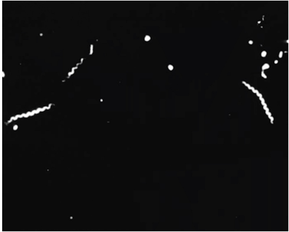
FIGURE 1: Dark field visualization of Treponema pallidum bacterial spirochetes.