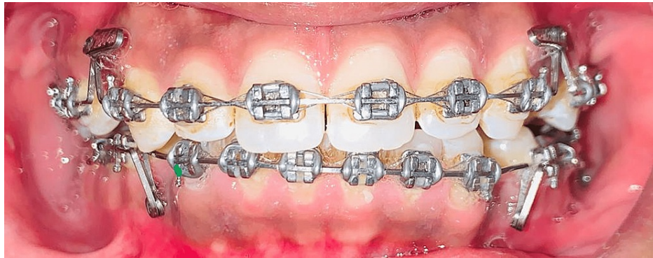
FIGURE 2: Stainless steel brackets

this work has localized corrosion resistance that is as excellent as titanium alloys (6.77%) because of the synergistic impact of heavy concentrations of nitrogen (0.331%) and molybdenum (0.904%) and is also believed to have high mechanical characteristics because of a "solution-strengthening effect" [6].