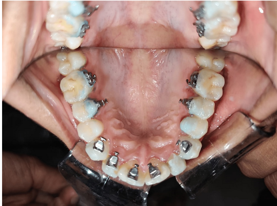
FIGURE 5: Lingual brackets

Lingual brackets are the same as various metallic orthodontic bracket kinds. The primary difference is that they are attached to the back of your teeth, not the front. Figure 5 shows lingual brackets. For those who prioritize aesthetics, this is particularly appealing. In addition, they protect your teeth from over-calcification. The lingual approach with a mushroom-shaped archwire had first been popularized by the Fujita. He started researching on lingual method in 1968, continued with studies in 1971, and eventually released the ideas behind the Fujita Bracket in 1978 [40,41]. The preferred outcome of adults and rising interest in lingual orthodontics, as well as the aesthetic and completely hidden nature of the device, are its benefits [41,42]. Speech disruption, occlusal interferences that regularly led to bond breakdowns and occasionally inhibited tooth development, an indirect vision that made it challenging to set brackets accurately, tongue laceration from sharp edges, gingival irritation from plaque build-up, and longer chair-side time due to the difficulty of inserting and ligating the archwire are some disadvantages.