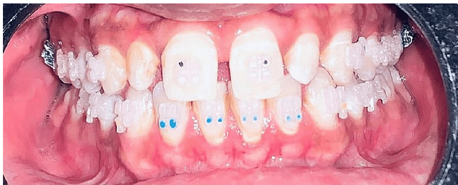
FIGURE 3: Ceramic brackets