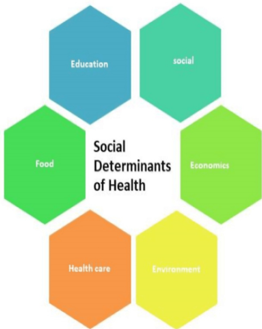
FIGURE 2: Social determinants of health