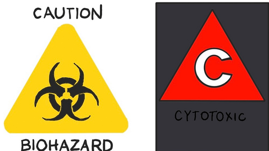
FIGURE 2: Biohazard signs symbolizing the nature of waste.

Figure 1 shows the biohazard signs that symbolize the nature of waste to the general public.