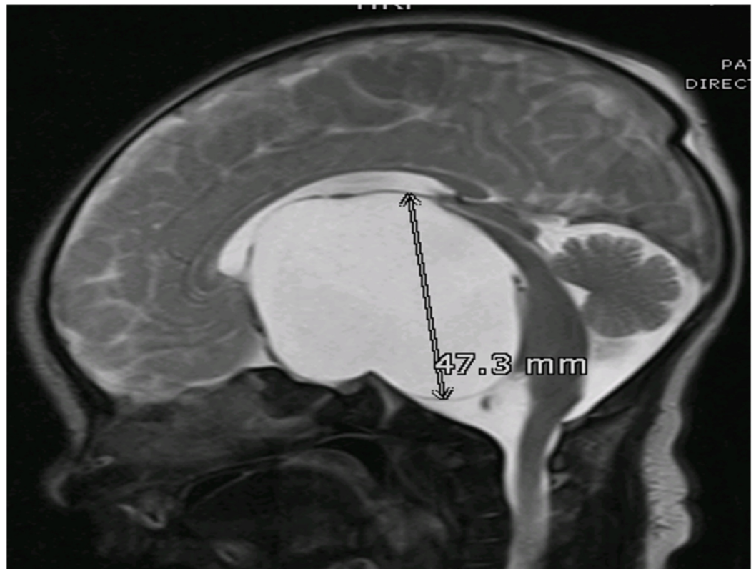
FIGURE 1: MRI T2WI, Sagittal Section

A large extra-axial, well-defined CSF intensity cystic lesion is identified in the midline in the sellar and suprasellar region. It measures 48 x 62 x 47 mm in AP transverse and cranio-caudal dimension. This lesion is causing a compressive effect on the third ventricle and bilateral lateral ventricles. These findings are consistent with arachnoid cyst.