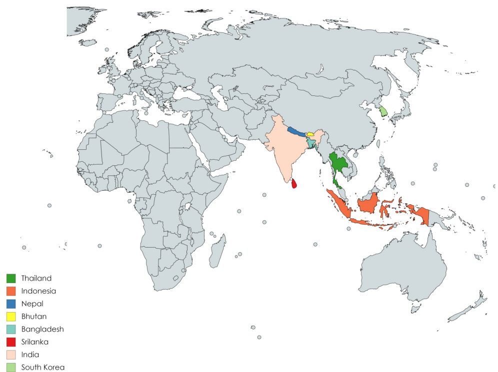
FIGURE 2: Countries included in this study

Almost all 19 studies differed in their setting, recall period, sample size, and study subjects. The studies covered 11,197 participants and the sample size ranged from 110 to 2,996. All studies included in this review were cross-sectional surveys. The studies were performed in WHO SEAR (Bhutan, Bangladesh, India, Indonesia, South Korea, Nepal, Srilanka, and Thailand) and illustrated in Figure 2. No studies were available from three countries of WHO SEAR (Myanmar, Maldives, and Timor-Leste). The recall period used in data collection varied among the different studies, ranging from one month to one year. A recall period was not available for all included studies. Studies were conducted among the general public, university students, and medical professionals. A detailed description of the characteristics of individual studies is provided in Table 1.