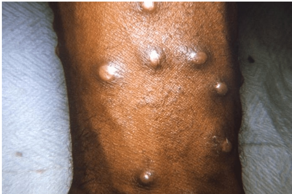
FIGURE 2: Maculopapular Lesions on Arm

Open access journal under a CC-BY license