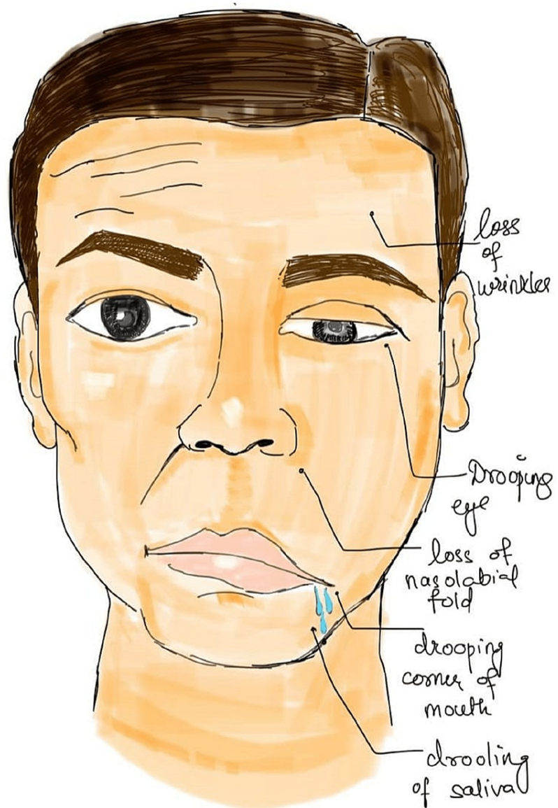
FIGURE 1: Depiction of clinical features of a patient with Bell's Palsy

The occurrence of symptoms is sudden, and the severity reaches a peak within 48 to 72 hours and ranges from mild fatigue to severe paralysis of facial muscles of the ipsilateral side. Symptoms of Bell's palsy include the inability to blink or close the eye, ruck up the lips or raise the mouth corner and shows features like drooping of half of the face, ipsilateral sagging of the eyebrow, nasolabial fold flattening, ipsilateral pain around the ear or hearing impairment, dry eye or dry mouth as shown in Figure 1 [19].