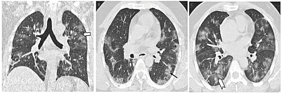
FIGURE 2: HRCT images of patients classified in moderate category.

A: Coronal image showing GGOs involving bilateral lung parenchyma (moderate category). Block arrow showing areas of GGOs.