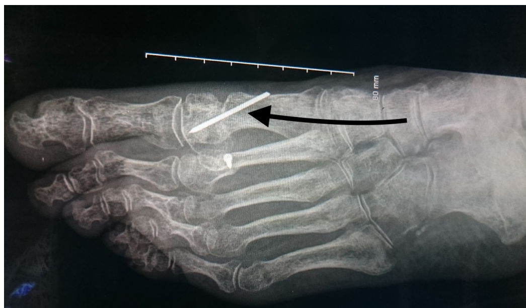
FIGURE 3: The distal chevron osteotomy and Kirschner (K)-wire fixation.

Black arrows showing the cut and translation.