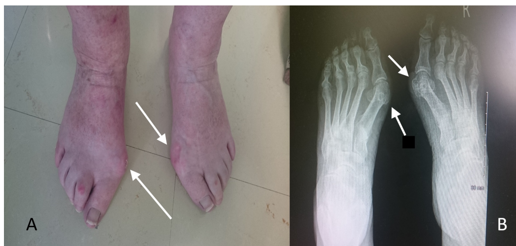
FIGURE 1: The clinical (A) and radiological (B) presentation of a 62-year-old female with hallux valgus deformity.

We performed a prospective study from January 2015 to January 2016. We selected the patients with hallux valgus who underwent distal chevron osteotomy for hallux valgus with Kirschner (K)-wire fixation over that period; the K-wire was chosen as it is cost-effective and technically easier to manipulate. The patients were adults. The surgery was performed by an orthopedic foot and ankle surgeon. There was no randomization or blinding of the patients to this study. The patients' progress was followed for one year with regular visits as outpatients (Figures 1-3).