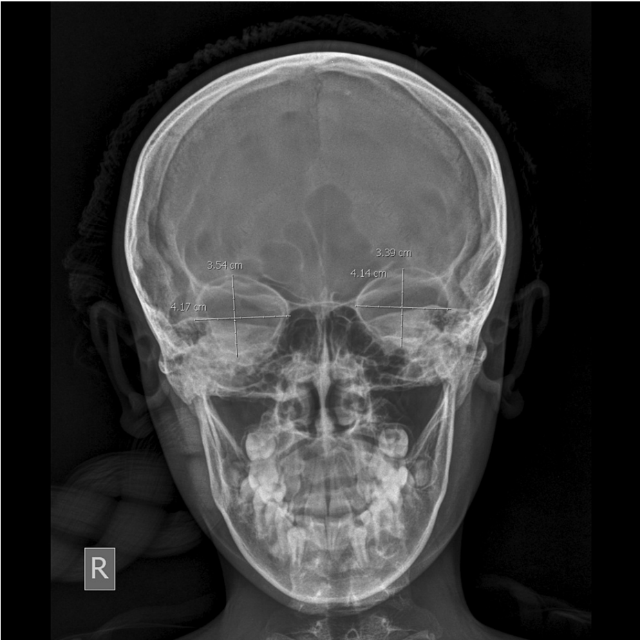
FIGURE 1: Frontal digital radiograph of skull showing the orbital margin and measurement of orbital height and width.

The orbital height was measured from the frontal film as the distance between the superior and inferior orbital margins; it is perpendicular to its width and similarly divides the orbit into two halves. The orbital width was also measured from the same frontal film as the distance between the midpoint of the medial margin of the orbit to the midpoint of the lateral margin. The OIs were calculated from the data collected using the following formula: OI = (\text{height of orbit} / \text{width of the orbit}) \times 100 . The interorbital distance, that is, the minimum distance between the medial walls of the orbits (distance between the left and right dacryon), and biorbital distance, that is, the maximum distance between the lateral walls of the orbits (distance between right and left ectoconchion), were also measured (Figure 2).