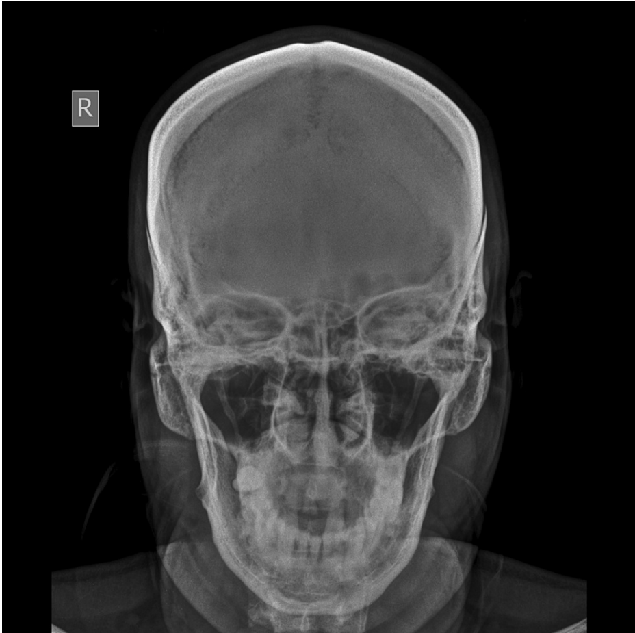
FIGURE 3: Transversely elliptical orbit.