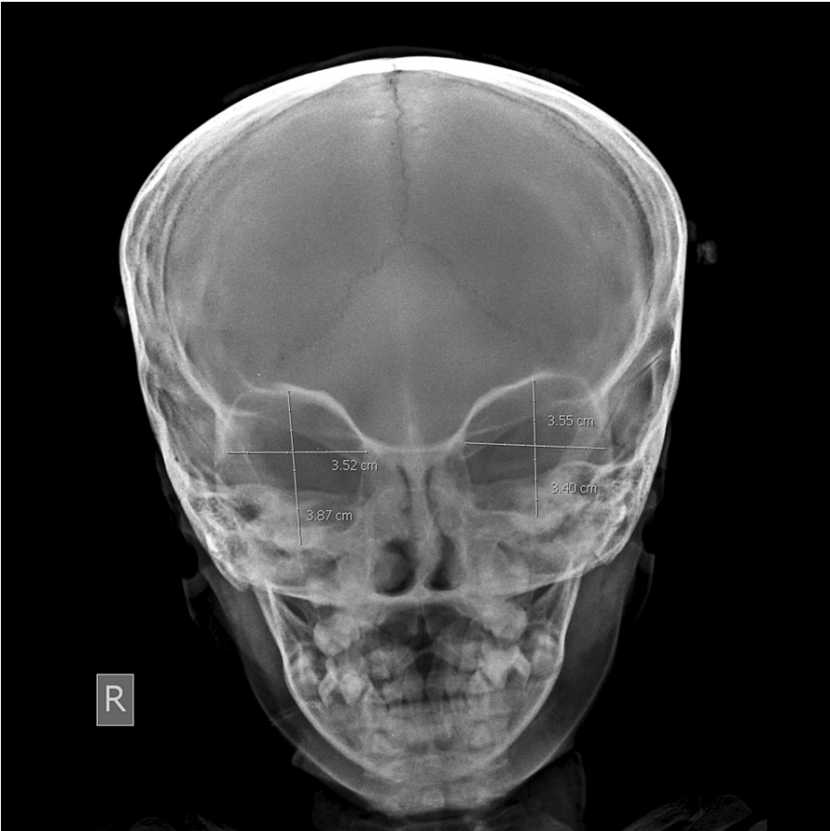
FIGURE 4: Rectangular orbit.