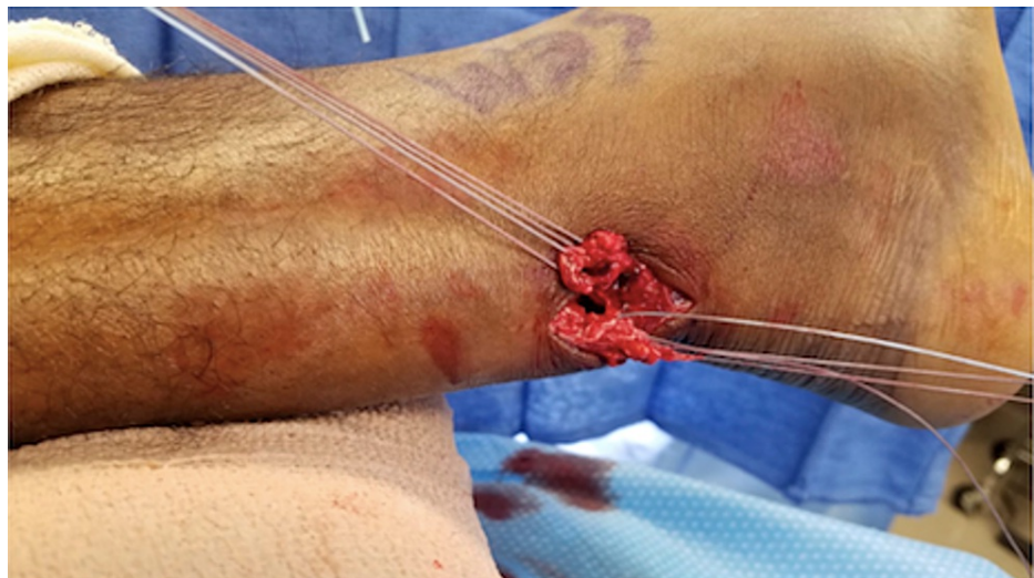
FIGURE 4: The four-stranded double Krackow locking stitch is demonstrated here after application to both the proximal tendon and distal tendon segments

Next, attention is moved to the proximal stump. Tenotomy scissors can be used to longitudinally incise more paratenon for improved visualization. With adequate exposure, the four-stranded double Krackow locking stitch is then applied to the proximal tendon. The free suture ends are then paired and tied to approximate the ends of the ruptured tendon, such that the repaired side is left under tension (Figure 5). This typically represents about 5 degrees of plantarflexion. Next, a 0 Vicryl (Ethicon, Inc., Bridgewater, USA) is used as a running the epitendinous suture for additional reinforcement.