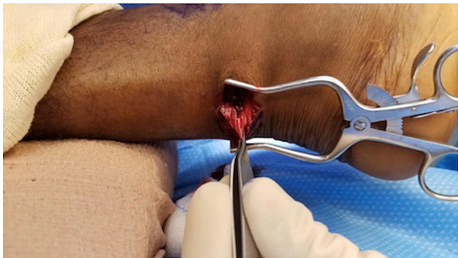
FIGURE 2: Subcutaneous tissues are spread to encounter the Achilles paratenon

Attention is first directed to the distal stump. The ankle is plantarflexed, delivering the distal segment through the incision and into view (Figure 3). Once the distal stump is exposed, we use #2 FiberWire (Arthrex, Inc, Naples, USA) for a four-stranded double Krackow locking stitch. This stitch uses one FiberWire to create two rows of locking stitches on the medial half of the tendon and another FiberWire to form two rows on the lateral half of the tendon. The technique should leave four free suture ends from the distal stump (Figure 4).