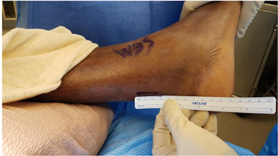
FIGURE 1: Measurement of incision line marked by a marking pen