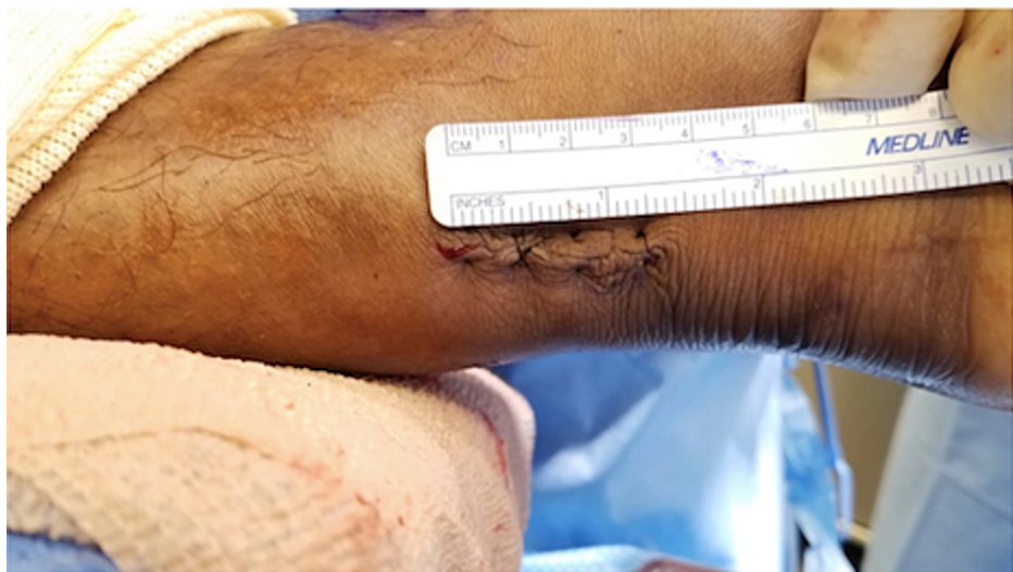
FIGURE 6: Subcutaneous tissue is closed with 4-0 Monocryl, followed by 3-0 nylon suture for the skin

The wound is irrigated with sterile saline and the paratenon is closed with a 2-0 Vicryl suture. Subcutaneous tissue is closed with 4-0 Monocryl (Ethicon, Inc., Bridgewater, USA), followed by 3-0 nylon suture for the skin (Figure 6). Postoperatively, a short leg-splint is applied with the ankle in slight plantarflexion.