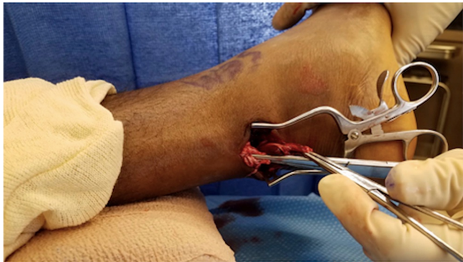
FIGURE 3: The ankle is plantarflexed, delivering the distal segment through the incision and into view