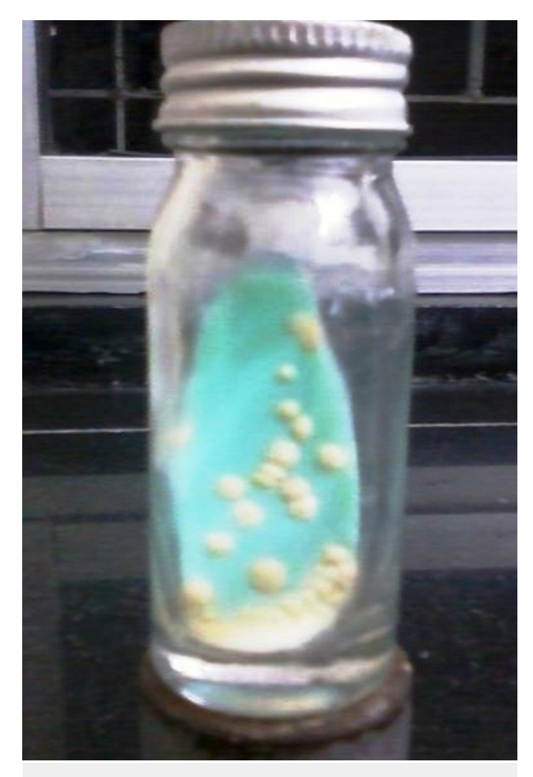
FIGURE 2: Lowenstein Jensen's (LJ) medium showing growth of Mycobacterium tuberculosis.

Colonies, which were flat, smooth, moist, white, easily emulsifiable, and growing rapidly either with or without pigment production, were identified as NTM.