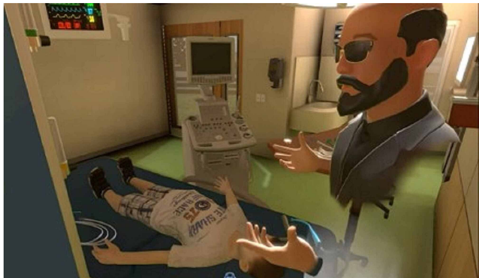
FIGURE 3: Image from VR application showing the avatar-based tutorial layout

The VR group completed a 19-minute immersive tutorial that outlined the steps involved in preparation for pediatric airway intubation. An interactive avatar in the VR tutorial (Figure 3) discussed the steps in detail in a room created to replicate the PICU's patient room.