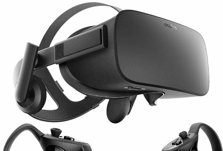
FIGURE 1: Head-mounted set with hand controls

The VR technology used included Oculus Rift S headset with hand controls (Facebook LLC, San Jose, CA) (Figure 1) and an Alienware gaming laptop (Dell Technologies, Round Rock, TX). The VR simulation software tutorial for pediatric airway intubation was developed using the Acadicus simulation platform (Arch Virtual, Madison, WI).