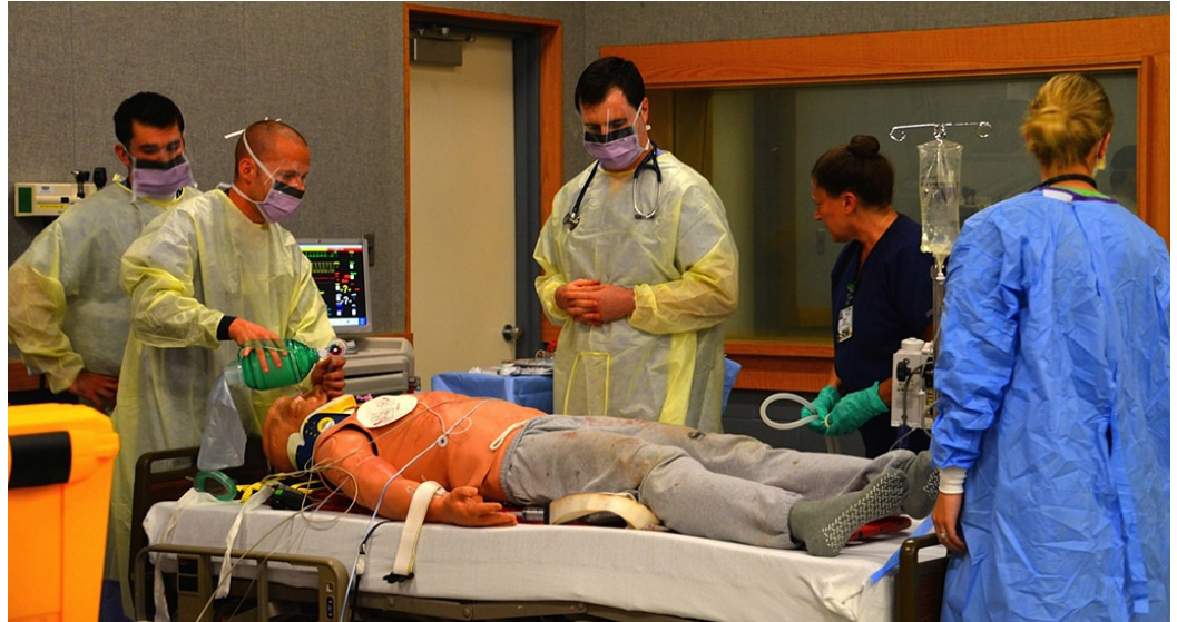
FIGURE 2: Trauma boot camp

Interns managing a simulated trauma patient during a one day trauma boot camp