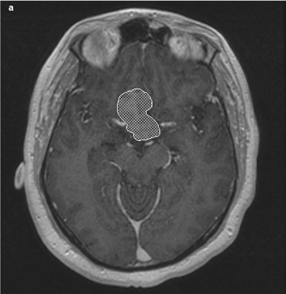
FIGURE 1: Representative axial spoiled gradient recall echo (SPGR) MR image of preoperative pituitary tumor post-volumetric analysis highlighting tumor silhouette