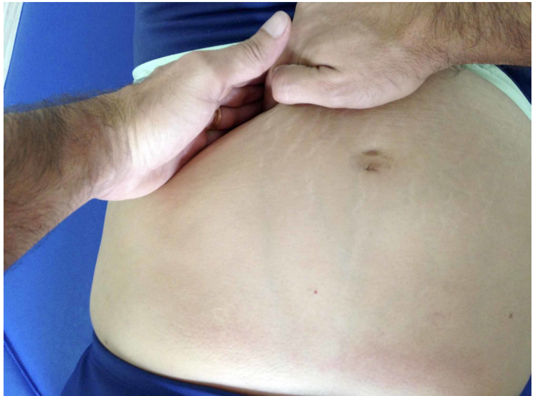
FIGURE 1: Mobilization of the sigmoid colon