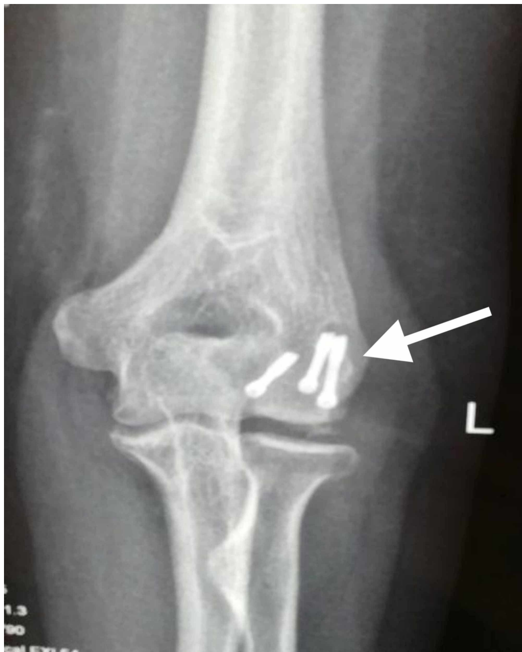
FIGURE 3: Post-operative X-ray radiograph anteroposterior(AP) view showing a fracture of the capitellum managed with Herbert screw fixation