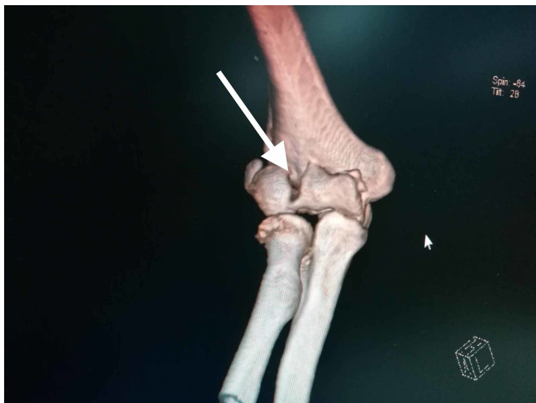
FIGURE 1: Computed tomography (CT) scans with a 3D reconstruction helps in the better assessment of the fracture profile

Our study included 10 consecutive adult patients from June 2017 to July 2018 with coronal shear capitellar fractures. None of the patients had the involvement of the posterior condyle along with a fracture of the capitellum. Preoperative consent was taken for all patients and approval from the department was taken. All the patients were followed up for a minimum of 12 months. They were all treated with open reduction and internal fixation with Herbert screws by the anterolateral surgical approach within five days of trauma. Open fractures were excluded from our study. The mechanism of injury, clinical examination, and radiographic data were recorded in each patient. Preoperatively, anteroposterior (AP) and lateral X-ray radiographs of the elbow were taken. Computed tomography (CT) with 3D reconstruction was done for a better assessment of the fracture profile and to rule out other injuries (Figure 1). The Dubberley classification system [5] was used to classify the fractures (Table 1).