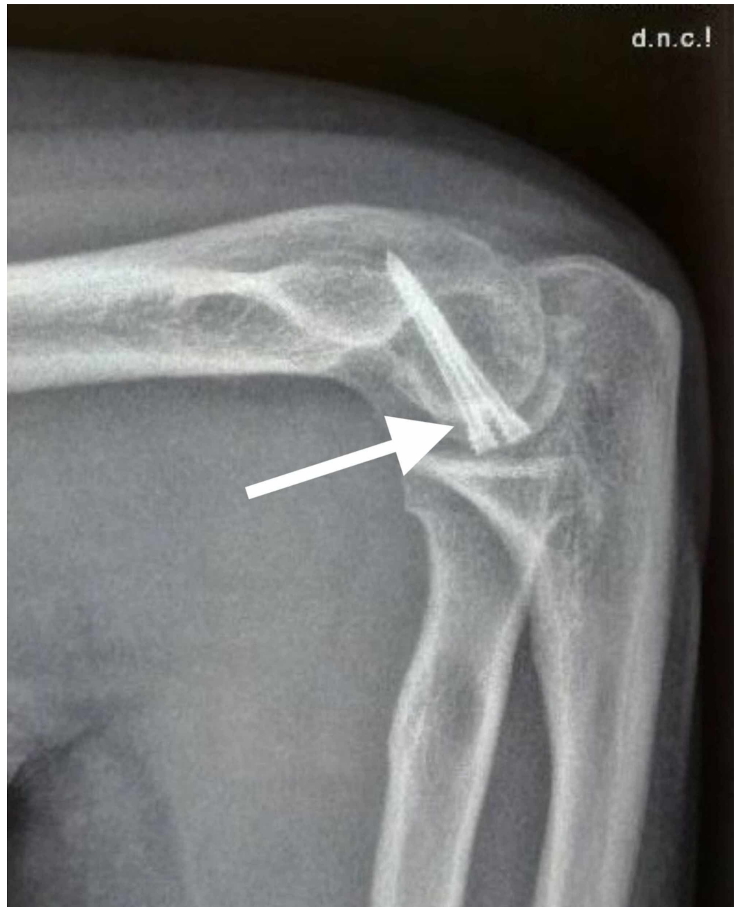
FIGURE 4: Postoperative X-ray radiograph lateral view showing a fracture of the capitellum managed with Herbert screw fixation

The elbow was immobilized in an above-elbow posterior splint to provide relief from postoperative pain. The elbow was kept at 90° of flexion and neutral rotation for five days in the splint. Adequate postoperative analgesia was given after consultation with the anesthesia team. The drain was removed after 48 hours and the active range of motion (ROM) of the elbow was started after five days.