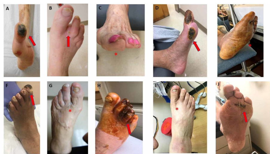
FIGURE 1: Subjects at baseline

Categorical values n (%); continuous values mean (std); baseline metals mean (CI); estimated Glomerular Filtration Rate (eGFR) was calculated by the Modification of Diet in Renal Disease Study equation