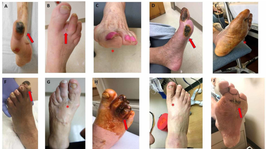
FIGURE 1: Subjects at baseline

Baseline photographs of all subjects before starting edetate disodium chelation therapy. Red arrows indicate the wound at baseline. The red asterisk indicates patients with no wounds and with rest pain at baseline. (A-I) Patients 001 to 010.