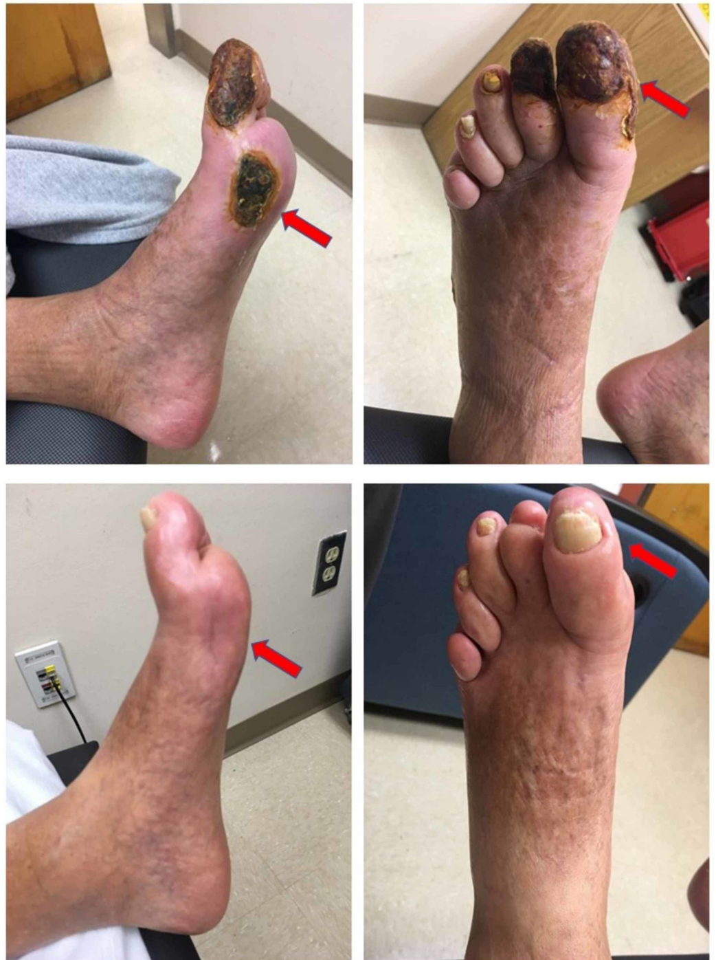
FIGURE 3: Post-edetate disodium-based chelation

Complete resolution of dry gangrene after edetate disodium-based therapy (top baseline, bottom infusion 48)