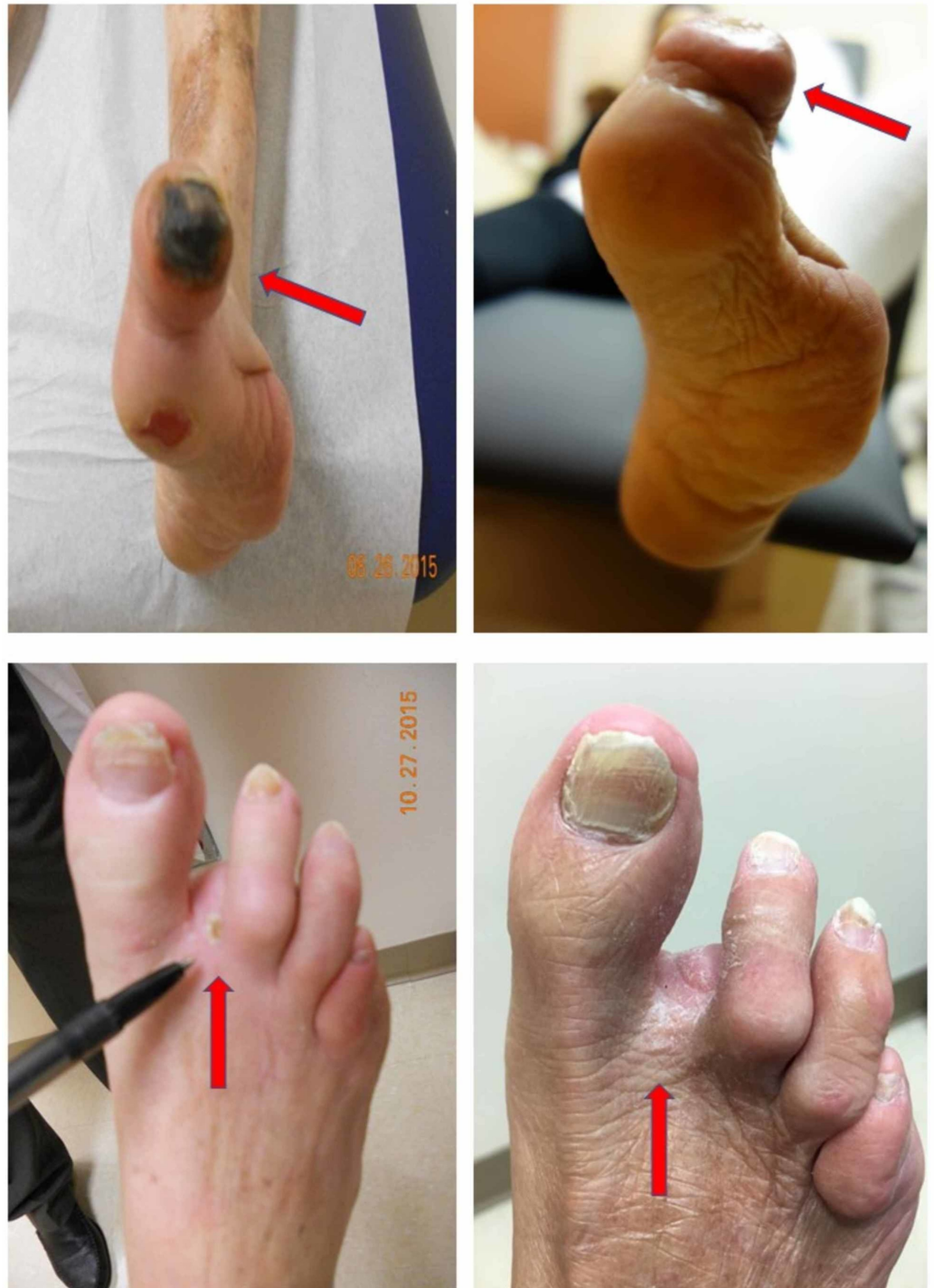
FIGURE 2: Wound healing

Dry gangrene and non-healing ulcer at baseline and infusion 40 for subjects 01 (top row) and 02 (bottom row), demonstrating complete resolution