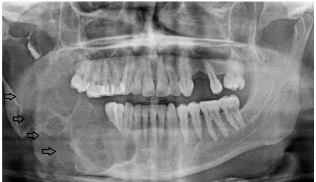
FIGURE 1: Patient 14. A 38-year-old male with right-sided facial swelling. Preoperative orthopantomogram revealed multilocular lucencies (arrows) on the right side.

In contrast to unicystic variant, multicystic ameloblastomas have shown high incidence of recurrence. In literature, reported recurrence rates of such variant are considerably higher [22]. Preoperative OPG of a patient with multicystic ameloblastoma is shown in Figure 1.