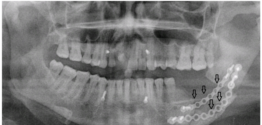
FIGURE 2: Patient 4. A 55-year-old male with left-sided facial swelling. Postoperative orthopantomogram shows reconstruction of mandible with plating (arrows).

The revolutions in the field of reconstructive microsurgery made free tissue transfer the method of choice for reconstruction of bony defect. In addition to covering large composite bony defects the free fibular flap also gives good aesthetic and functional outcomes with options for dental rehabilitation. Reconstruction of a mandibular defect with free fibular flap is shown in Figure 3.