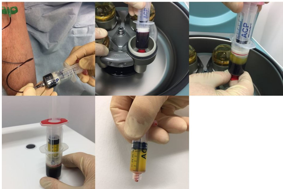
FIGURE 1: Preparation of platelet-rich plasma (PRP).