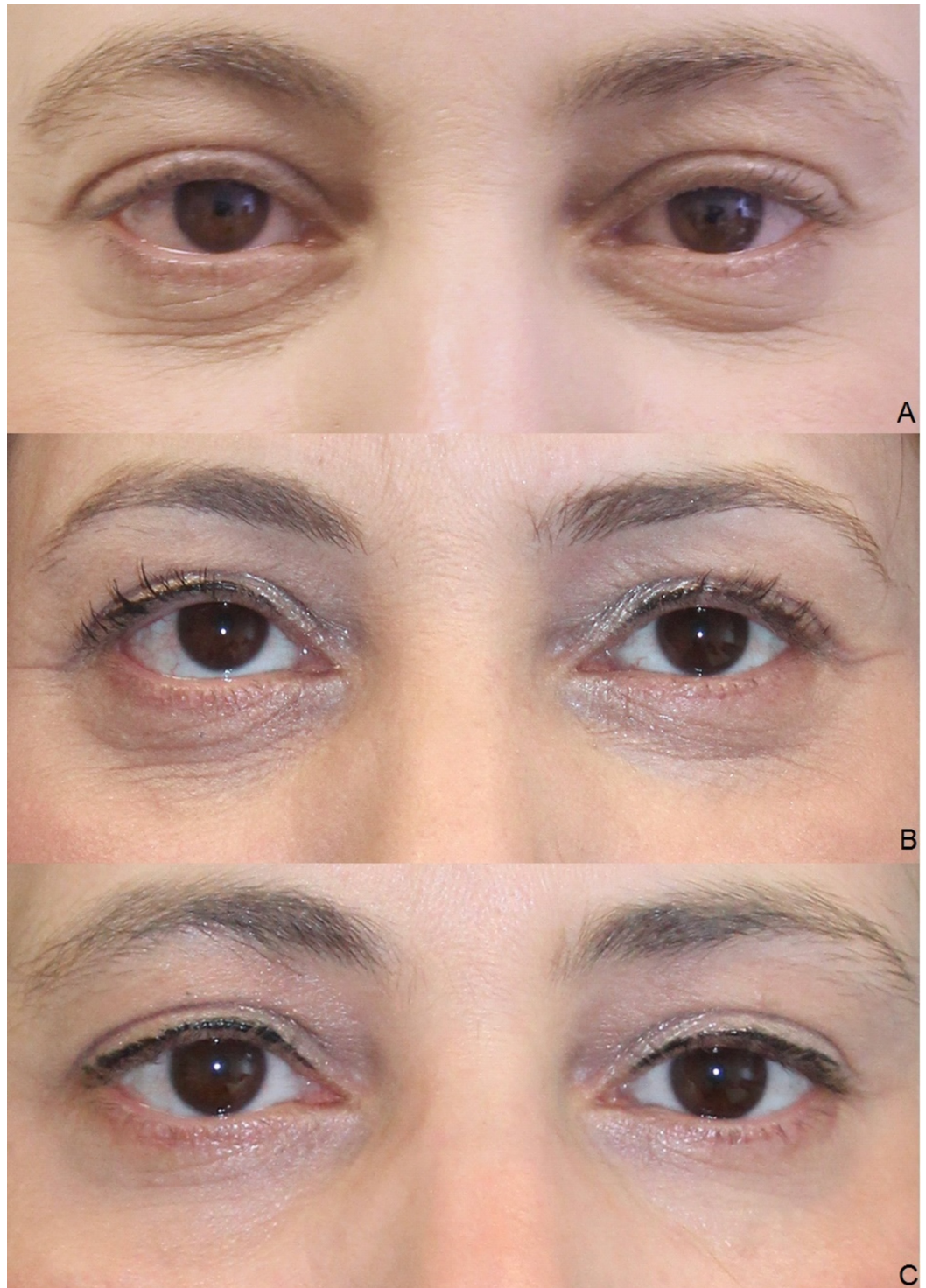
FIGURE 3: Treatment results.

Female, 23 years, before the first (A), before the second (B), before the third (C), and four weeks after the third injection of platelet-rich plasma (PRP) (D).