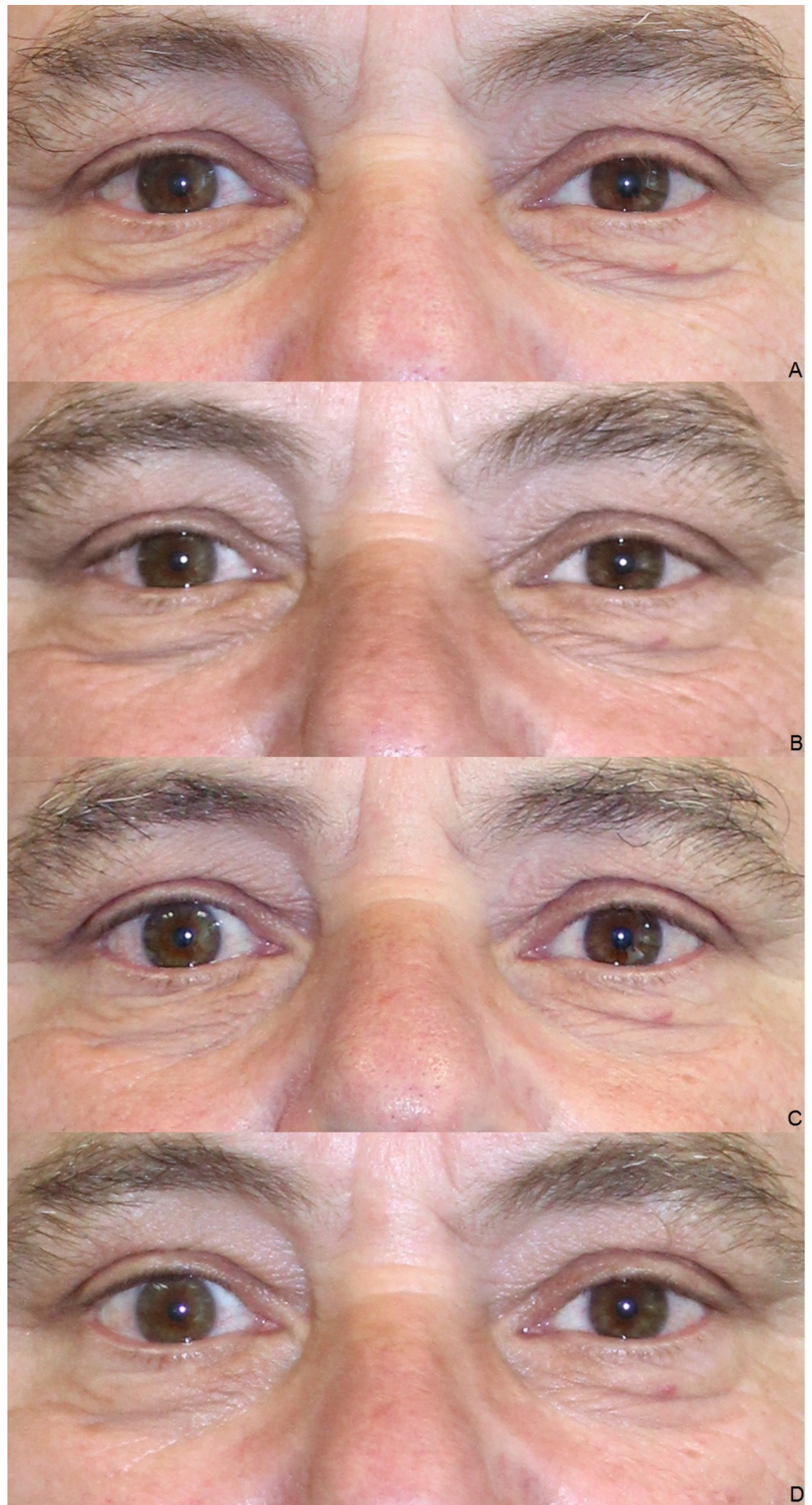
FIGURE 5: Treatment results.