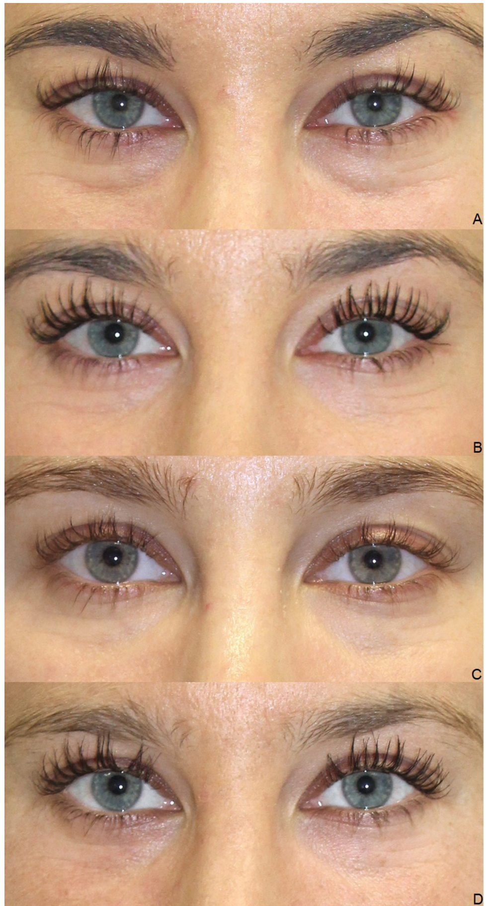
FIGURE 2: Treatment results.