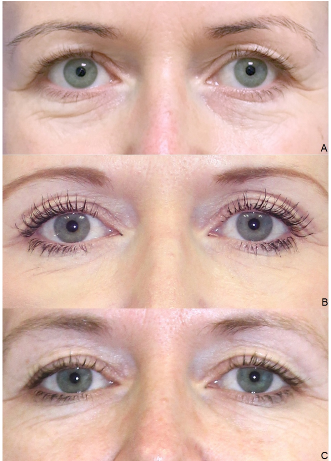
FIGURE 6: Treatment results.

Male, 60 years, before the first (A), before the second (B), before the third (C), and four weeks after the third injection of platelet-rich plasma (PRP) (D).