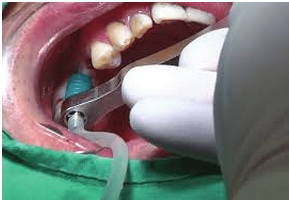
FIGURE 2: Hydraulic system for the sinus lift.

The nasal decongestant was started a day before surgery. To prepare PRF, 10 mL of intravenous blood was withdrawn under aseptic and sterile conditions in a test tube without anticoagulants and was centrifuged at 2,700 rpm for 12 minutes following Choukroun's procedure. The resultant PRF was used as space-filling material as well as the membrane that was transferred onto Schneider's membrane. The hydraulic lift was placed, as shown in Figure 2.