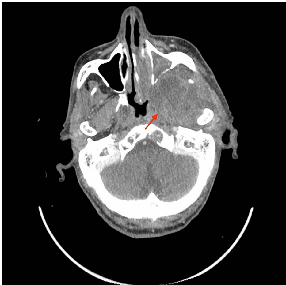
FIGURE 2: A CT scan performed six months after the end of radiation therapy showed a stable disease, with a residual lesion that extends to the infra-temporal fossa (arrow).