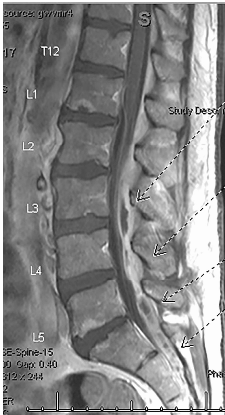
FIGURE 1: MRI (SAG T1 + contrast sequence) showing a long segment of epidural enhancement compatible with epidural phlegmon/abscess, extending T12 through the imaged sacral levels, which contributes to a varying degree of the spinal canal and neural foraminal narrowing