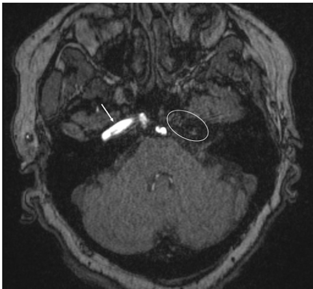
FIGURE 1: Axial 3D time of flight MRI of the head, noting absence of the carotid canal and internal carotid artery at the skull base (oval). For comparison, note the right-sided internal carotid artery (arrow) at the skull base.

imaging (MRI) scan was performed and identified the absence of the left carotid canal with an absence of flow signal (Figure 1). An unusual vessel was also seen to arise from the right cavernous internal carotid artery (Figure 2). The vessel traveled in the floor of the sella turcica (Figure 2). Additional imaging with 3D reconstruction from a computed tomography (CT) angiography better defined an aberrant origin of the left internal carotid artery (Figure 3). CT angiography noted the presence of an anterior communicating artery aneurysm, which was bilobed and measured 7 x 11 mm. The physical examination was unremarkable for any neurological deficits. Angiography found that the aneurysm was not amenable to endovascular treatment. Therefore, the patient underwent a right-sided craniotomy for clipping of her complex aneurysm and was soon discharged home with no complications.