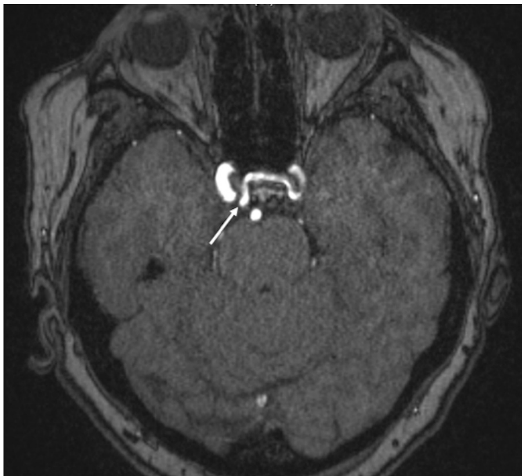
FIGURE 2: Axial 3D time of flight MRI of the head, noting the unusual origin of the left internal carotid artery (arrow) from the contralateral cavernous segment of the right internal carotid artery. Note the course of the left internal carotid artery through the floor of the sella turcica.