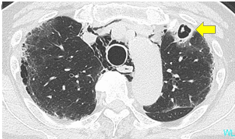
FIGURE 4: Chest CT findings on day 26

CAPA was suspected, and intravenous administration of voriconazole (at a loading dose of 500mg twice daily on day one, followed by 300mg twice daily on days 2 to 7) was initiated. The serum \beta -D-glucan test result was positive, and sputum cytology revealed fungal filaments. Serum antigen and sputum cultures were negative for Aspergillus . With rest and corticosteroid tapering, pneumomediastinum improved. Voriconazole-induced acute liver dysfunction was observed on day 26, and the antifungal drug was switched to amphotericin B (300mg once daily, intravenously). On day 34, amphotericin B was switched to itraconazole (200mg twice daily, orally) because of hypokalemia (minimum 2.3mEq/L). The cavity enlarged on the follow-up CT, which was done on day 26 (Figure 4).