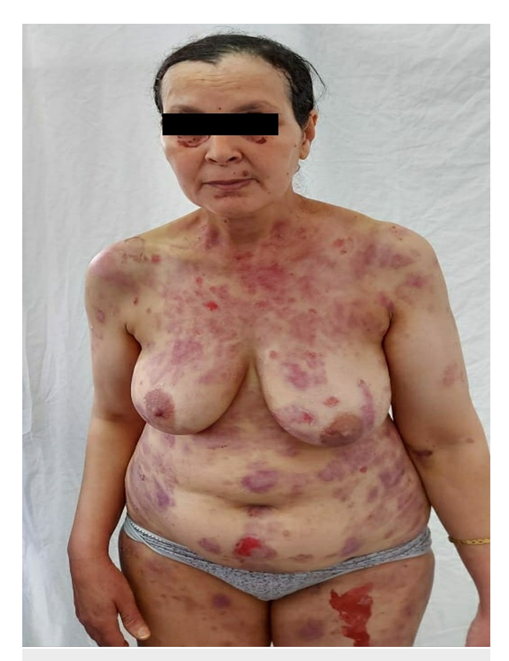
FIGURE 5: Post-bullous erosions, especially on the trunk, with a positive Nikolsky sign

She had no mucosal involvement. Histological examination showed a superficial epidermal blistering process with intact basal layer and intracepidermal eosinophils. Direct immunofluorescence showed intracellular IgG and C3, and indirect immunofluorescence was positive for anti-intercellular substance antibodies, indicating foliaceous pemphigus. The pharmacovigilance investigations determined a causality score of I5B4 for the vaccine, highly suggestive of a diagnosis of vaccine-induced pemphigus. The patient was put on oral corticosteroid therapy at 65 mg/day (1 mg/kg/day), with a complete resolution of lesions after only three weeks of treatment.