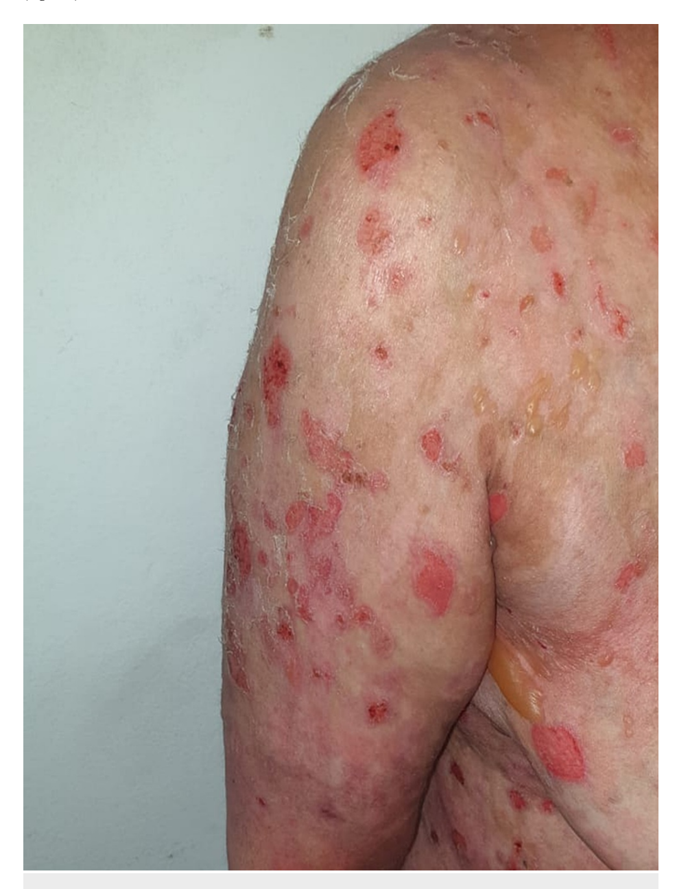
FIGURE 4: Several erosions on the erythematous base on the trunk with a positive Nikolsky sign

on an erythematous base measuring 3-10\,\mathrm{cm} in diameter on trunk and limbs, with a positive Nikolsky sign (Figure 4).