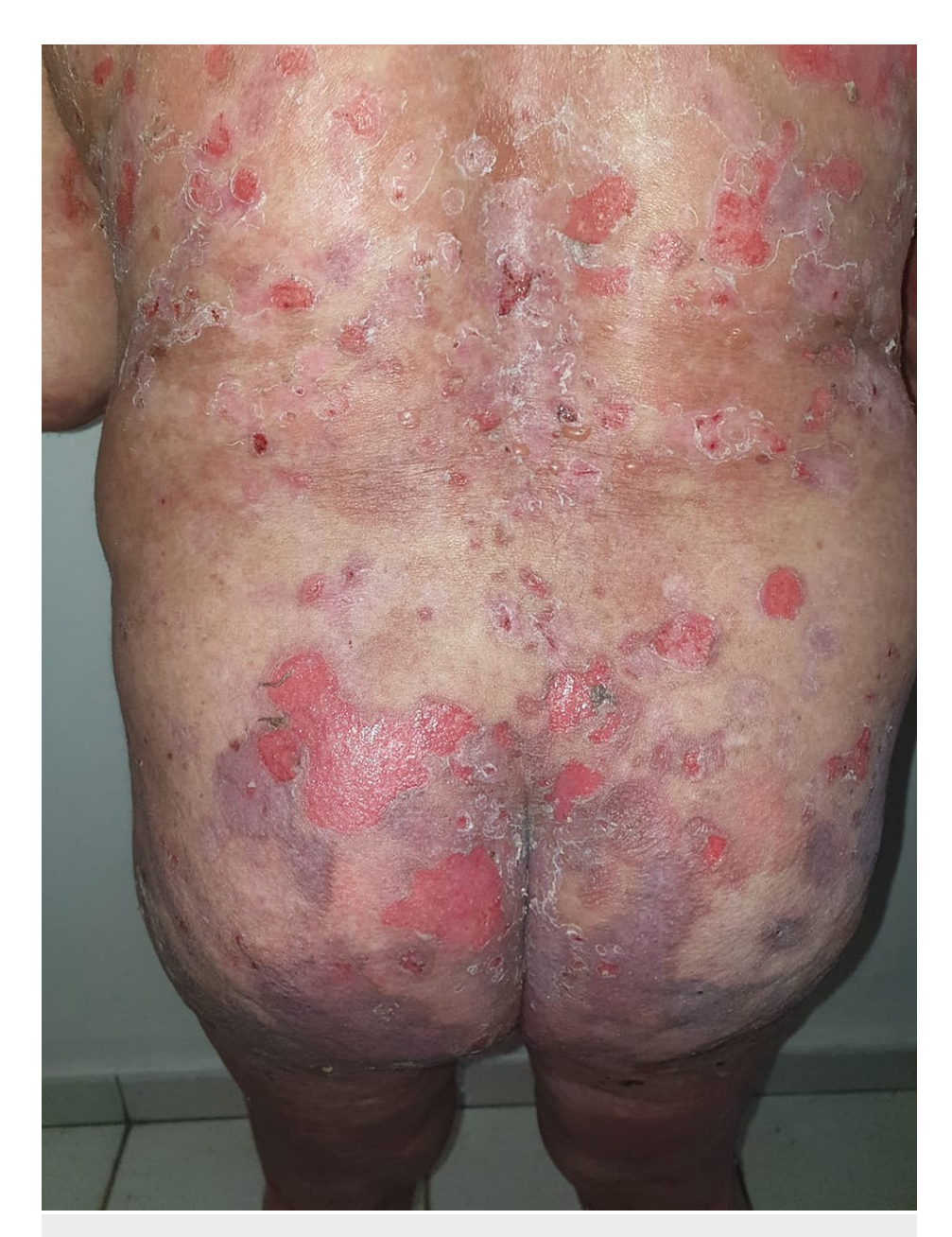
FIGURE 6: Post-bullous erosions, especially on the trunk, with a positive Nikolsky sign

She also had erosions on the oral and genital mucosa. A histological examination of an abdominal lesion revealed intraepidermal vesicle with acantholysis, and diffuse perivascular dermal lymphocytic and eosinophilic infiltration. Direct immunofluorescence demonstrated deposit of IgG and C3 on epidermal cell surface membranes. Based on these findings, a diagnosis of pemphigus Vulgaris was made. The imputability of both the vaccine and sertraline was studied and the investigations implicated the vaccine. The patient's condition improved with corticosteroid therapy at 55 mg/day (1 mg/kg/day). She is still scheduled to have her booster shot.