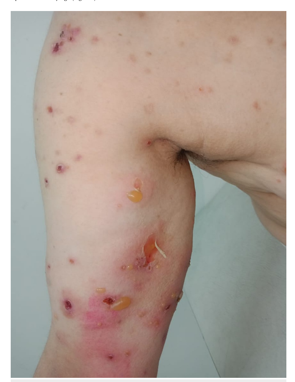
FIGURE 3: Tense bullae associated with erosions on the left arm with a positive Nikolsky sign

She also had erosions on the mouth palate. Histological examination showed subepidermal split with a superficial perivascular inflammatory infiltrate and predominant eosinophils. Both direct and indirect immunofluorescence were positive with linear IgG and C3, consistent with BP. Biological examinations revealed an eosinophil count of 2200/mm³. According to the previously cited pharmacovigilance protocol [3], the causality score assessment was I5B4 for the vaccine, highly suggestive of a diagnosis of vaccine-induced BP. The patient was put on topical corticosteroids with good evolution (clobetasol propionate 0.05%). The vaccine booster was not contraindicated but was refused by the patient.