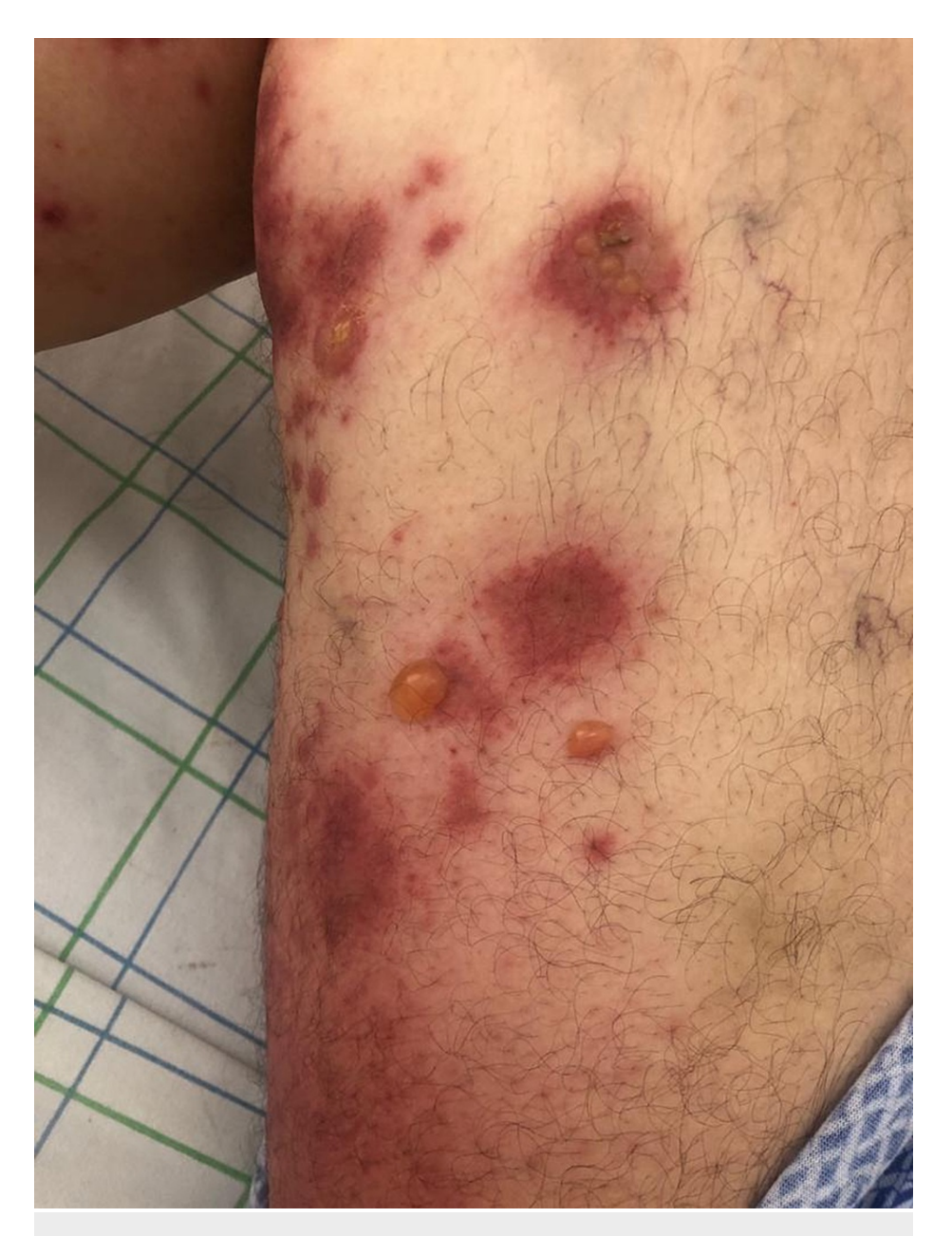
FIGURE 1: Tense bullae with clear content on urticarial skin on the right thigh