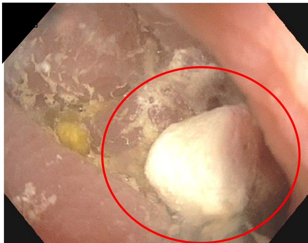
FIGURE 3: Colonoscopy: extracted barolith