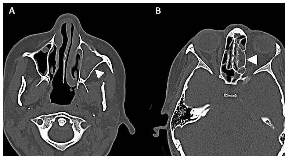
FIGURE 1: Pre-treatment CT scans showing persistent partial opacification of the paranasal sinuses with high internal densities.

(A) Almost complete opacification of the left maxillary sinus prior to medication use (arrowhead); (B) mucosal thickening of ethmoid sinuses more marked on the left side prior to medication use (arrowhead).