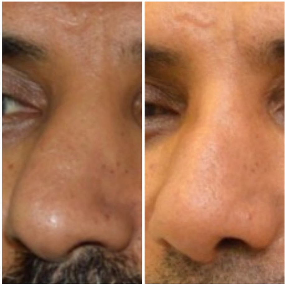
FIGURE 2: Before and after the rhinoseptoplasty.

When the patient was asked to rate his level of satisfaction on a scale of 1 to 5 (1 = extremely dissatisfied and 5 = extremely satisfied), he rated a 1 before surgery and a 5 after surgery for nasal blockages, and a 3 before surgery and a 4 after surgery for nose shape fulfillment. His family and friends rated a 1 before surgery and a 3 on his nose shape.