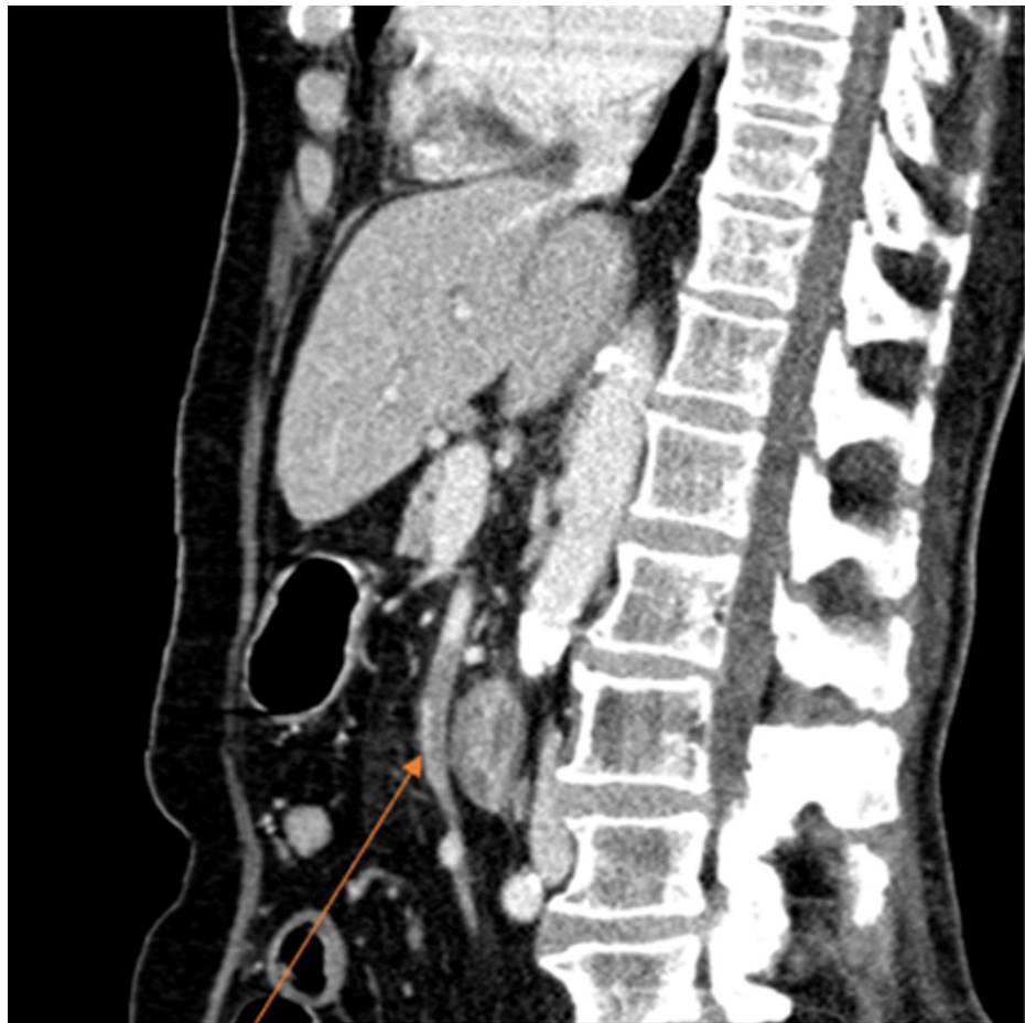
FIGURE 2: Abdominal and pelvic CT showing subtraction of the lumen of the upper mesenteric artery (arrow)