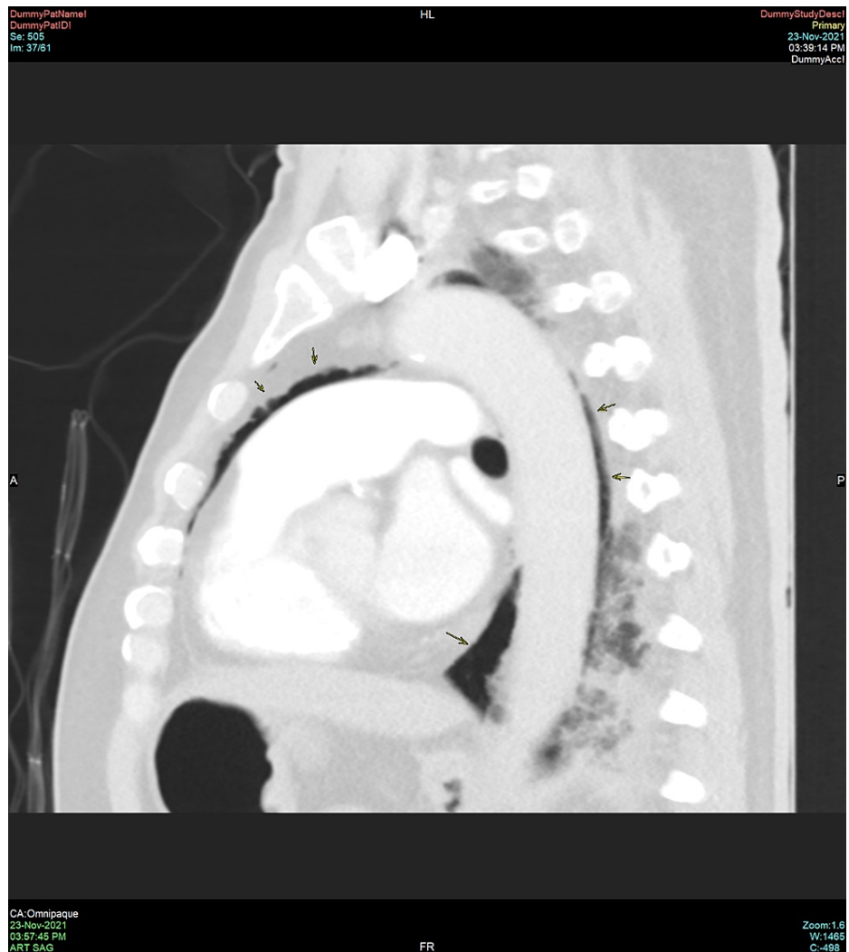
FIGURE 3: Sagittal view of a computed tomography scan of the thorax demonstrating pneumomediastinum (black arrows)

On day 40 of illness, the patient was found unresponsive with pulseless electrical activity on the cardiac monitor. Cardiopulmonary resuscitation (CPR) was initiated and he was intubated by the on-call airway team. Despite the resuscitation team's best efforts, no return of spontaneous circulation was achieved, and the patient was pronounced demised.