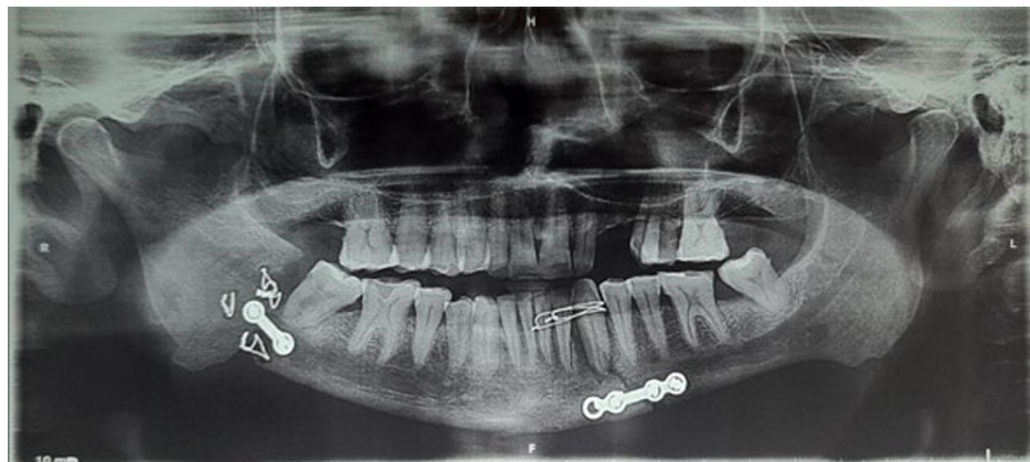
FIGURE 1: Pre-operative orthopantomogram (OPG) showing the discontinuity of the bony fragments at the right angle region of the mandible

The orthopantomogram (OPG) revealed the presence of multiple transosseous wires, a two-hole plate at the right angle region, and a four-hole plate at the left parasymphysis of the mandible. Additionally, interdental wiring involved tooth number 22 to tooth number 24. A wide discontinuity of the bony fragments was still appreciable at the right angle region of the mandible (Figure 1).