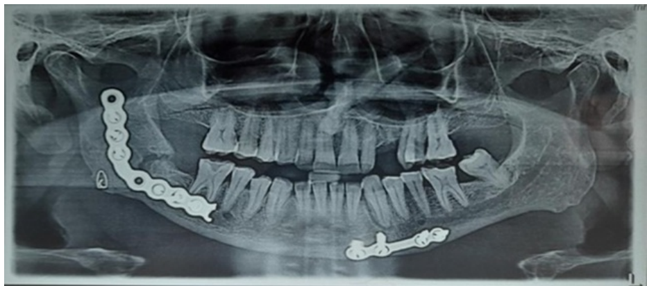
FIGURE 5: Post-operative orthopantomogram (OPG)

Besides, the old plate at the left parasymphysis region was removed and replaced with a new plate with proper fixation. Pain during the procedure was measured using the Visual Analog Scale (VAS), which the patient elicited as a two.