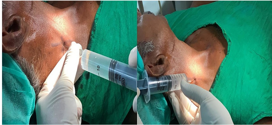
FIGURE 2: Administration of the superficial cervical plexus block (SCPB)