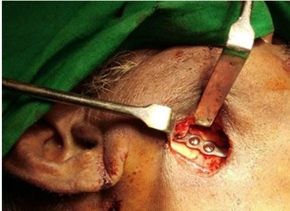
FIGURE 4: Operating under superficial cervical plexus block (SCPB)