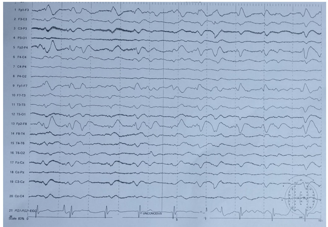
FIGURE 3: EEG showing severe diffuse encephalopathy of non-specific nature.