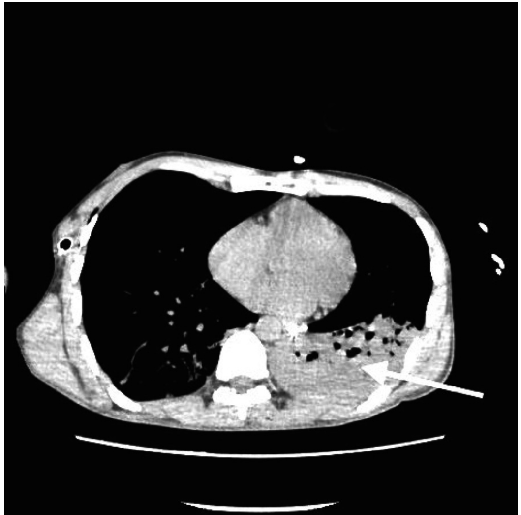
FIGURE 2: Computed tomography showing large left lower lobe consolidation.

Based on history, clinical presentation and laboratory investigations, a differential diagnosis of metabolic encephalopathy, and toxic encephalopathy due to sepsis, possible brain stem diseases and drug overdose were considered. CT of the brain was normal.