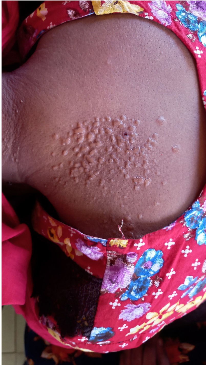
FIGURE 2: Papular skin rashes over her upper trunk.

To publish this image, consent from the patient is obtained.