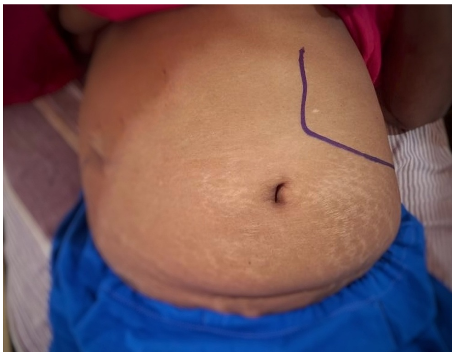
FIGURE 1: Abdomen examination revealed an enlarged spleen, no hepatomegaly, and no other intra-abdominal masses.

Consent was obtained from the patient to take the photograph and publish this image.