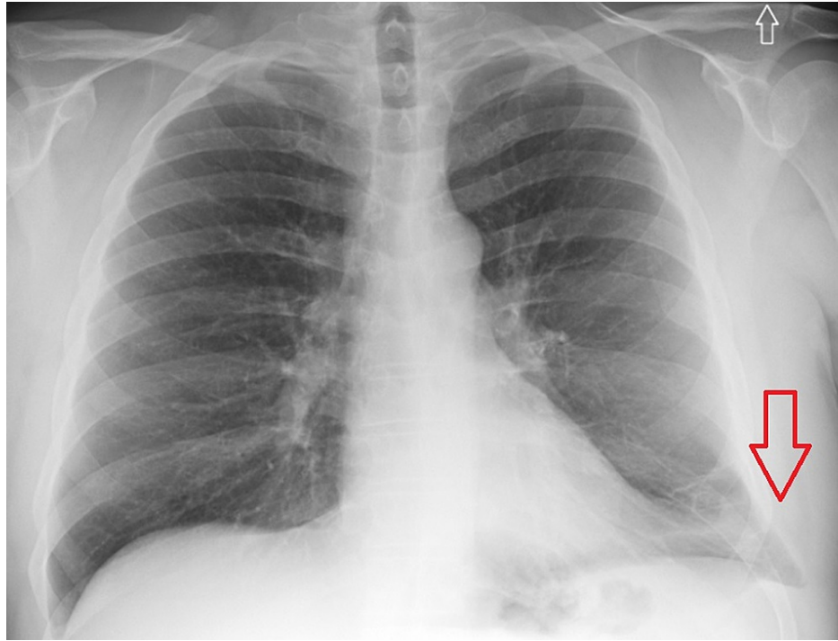
FIGURE 1: Posteroanterior chest radiography evidencing protrusion of pulmonary tissue beyond costal margins in the left lower lung aspect (red arrow).

A CT of the chest showed bibasilar infiltrates, small left pleural effusion, and a contusion on the left flank. It also showed a left-sided pulmonary herniation between ribs 8 and 9, without any evident rib fractures (Figures 2-5).